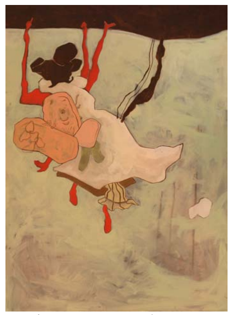
Figure 5, Outstretch, 2007

In order to make a transition from figure to ground and vice versa possible, I prefer not to use linear perspective. Flatness is one of the main underlying elements of my works. Because, I think, linear perspective strictly defines the separation between figure and ground, it transforms the ground into a rigid element. I, on the other hand, prefer ground to be an indefinable field in my images, so that it can contain concealed. "This perspective which determines what is forth, what is back, what is far, what is close in the image space, reclaims not only the visible but also the invisible, since it transforms the image into a space that can be observed from the opposite side and controlled." (Sayın, 16)