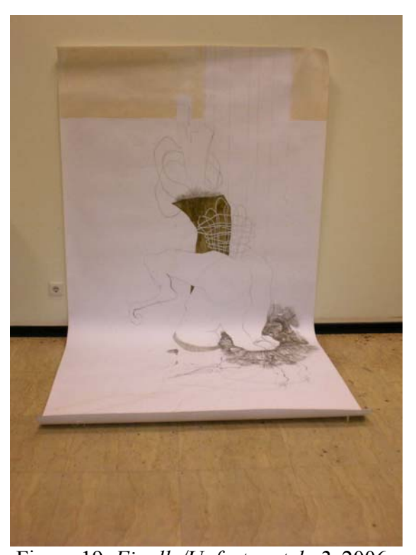
Figure 19, Finally/Unfortunately 2, 2006

In these works, the lemon juice drawings attract attention to the mark of a touch. The lemon juice leaves traces on the paper which refers to a certain retrospective materiality. These traces have their own history which began with the touch of a brush. They are invisible at first, become yellow after a while, then go brownish and may be after a long while, these traces will pierce the paper, because the acid in the lemon juice will continues to process the paper.