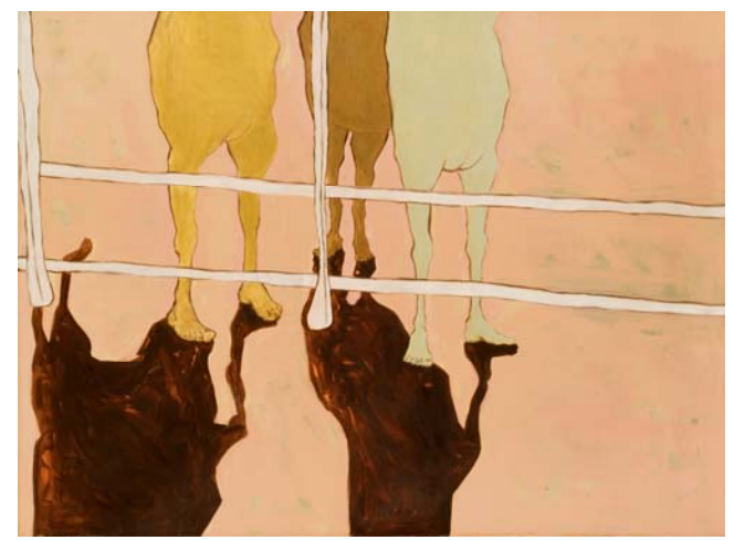
Figure 3, Package, 2006

that can be conceived by the rational mind. However, I would sooner facilitate the irrational and the indefinable in my images. "It is only possible to comprehend what it is by comprehending what it is not." (Florenski, 13) In this sense, it is very crucial that the concealed remain a space bearing limitless possibilities of comprehension.