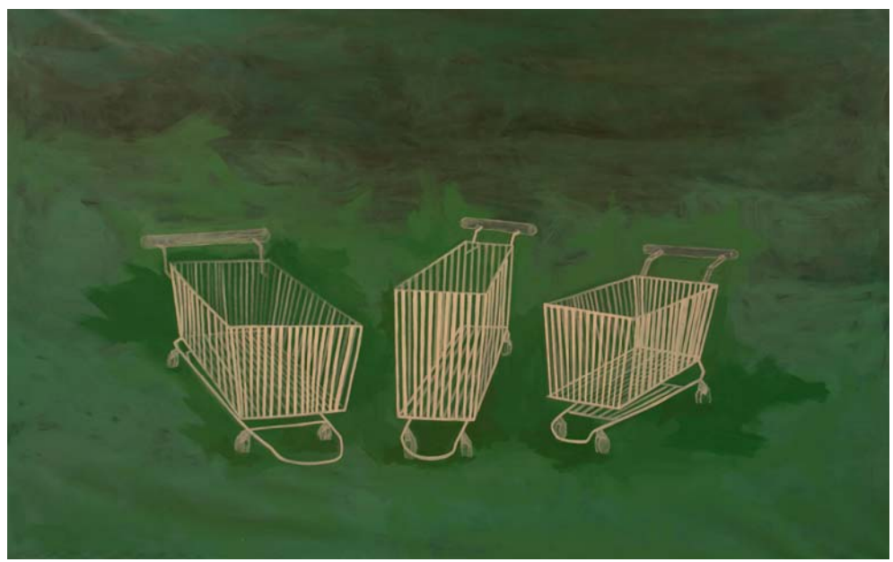
Figure 7, We Came, 2007

My large scale paintings are big enough that the viewer can make eight to ten steps in their width and experience them from different angles. During the process of painting, I first consider the aspect of ground. Because it is usually the case that the ground in my paintings generally constitutes the largest part of the canvas and the canvas contains several layers of paint, which also constitute the ground layers. In some parts, I leave bare and untreated space without any paint on it, in order to attract attention on these multiple layers of paint.