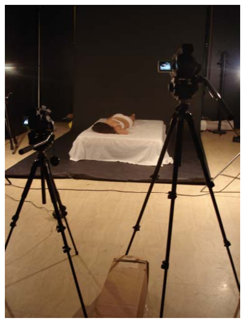
Figure 25, the making of Whereon, 2007

The opposition between the vertical and the horizontal is another important concern I have in this work. Like the figure, verticality is privileged in relation with horizontality. According to Freud and Battaille, this aim originates from the vertical status of human. "Like Freud, Battaille thinks that the human's desire to dominate the space in which he takes part, rather than being included within it, is connected with the vertical standing position of human." (Sayın, 163)