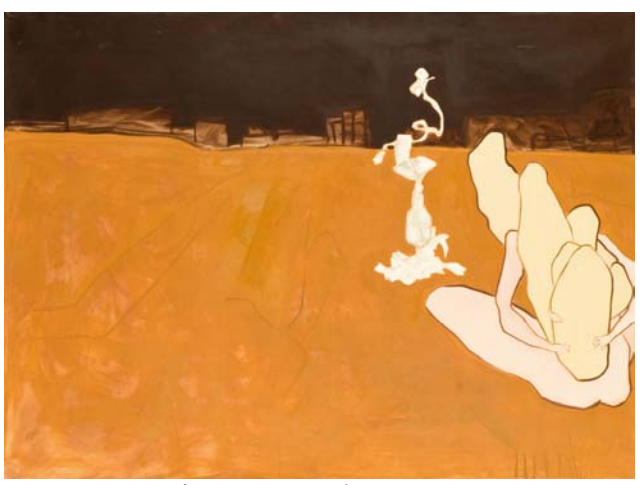
Figure 15, Bolg , 2007

My works emerge from my personal and private sources. However, this does not mean that I represent my own experiences and personality in my works. Instead, I want to create an undefined space within my works, to which each viewer can relate a part of himself/herself. Yet, it is very essential that I try to reach this indefinability through my very own personality and corporeality.