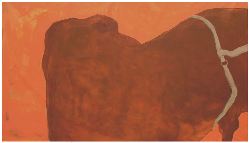
Figure 6, Figure, 2007, 3mX1.80m

I do not only seek to use figure and ground as reversible entities on the canvas and paper, but I also want to have the same sense of transition between the figure and the ground by means of the canvas and paper.