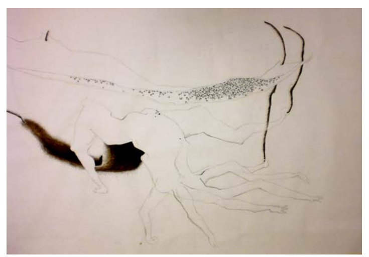
Figure 20, Finally/Unfortunately 3, 2007

In the drawings I made with the invisible lemon juice and visible brown ink, my aim is also to propose a figure ground relationship different than a binary opposition. In a binary opposition, the privileged figure and the subordinated ground are strictly separated. In these works, however, the ground is not a left-over. It is not a part of the drawing which is not worth looking at, but space which conceals something inside. I want to draw the viewer's attention to the ground as I would like to break the visual tradition which prioritizes the figure.