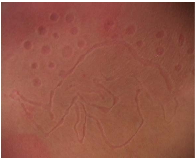
Figure 23, View from the video Whereon, 2007

In this work, I drew on a sheet with silicon which makes the drawings embossed. Then I spread out the sheet on a bed. I laid on the bed and changed the position of my body every 20 minutes. The silicon drawings left marks on the parts of my body that I was lying on. Meanwhile, two cameras recorded a video of the parts of my body which had marks of the sheet. The cameras recorded until the marks disappeared.