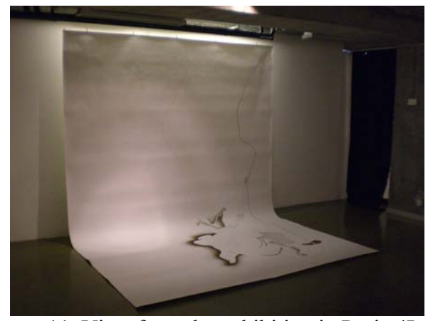
Figure 11, View from the exhibition in Proje 4L, 2007

First, I hang the papers by leaving a distance between the wall and the paper. I prefer this in order to present my work as a two dimensional ground which is drawn on and also as an object which has its own materiality. Recently I have also started to use handmade Japanese rice papers to draw on. They are light and yellowish and their veins are visible. These papers and my drawings are both resemble fabrics and they arouse a sense of fragility. For this reason, I think, they relate with my drawings better than regular drawing papers. They prioritize the material which thereby gives me the chance to utilize them not only as grounds but also as figures.