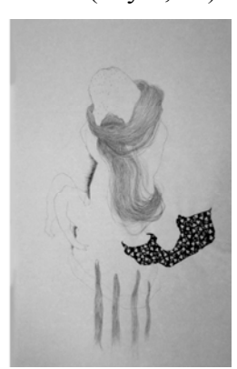
Figure 13, Untitled drawings, 2007