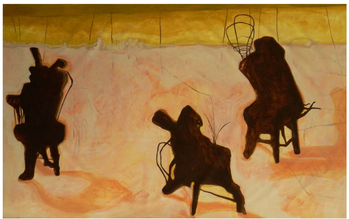
Figure 17, Sitters, 2006

Finally, I sometimes refer to the shadow archetype directly in my works. Yet, generally, I only imply the shadow archetype by way of concealing images, because the shadow archetype is concealed within human beings, just like 'the concealed' within images. I consider getting involved with the shadow archetype to be a step or a way for me to produce concealed images in order to create a space of indefinability and interpretation.