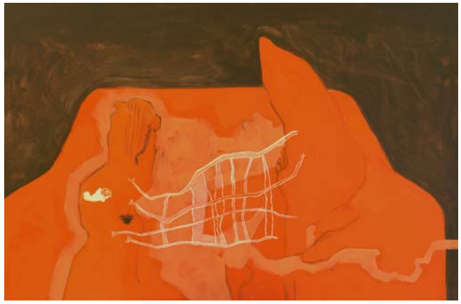
Figure 4, Patterns, 2006

The concealed within my images is mostly born by the interplay of figure and ground. My intention is to use figure and ground as a transition. I do not try to prioritize one to the other, nor do I use them as a binary opposition. I am curious about the potential of reversibility that figure and ground possess. I am interested in how a ground transforms into a figure and how a figure transforms into a ground. This approach, I believe, is one of the ways to conceal an image and to create an indefinable field within it.