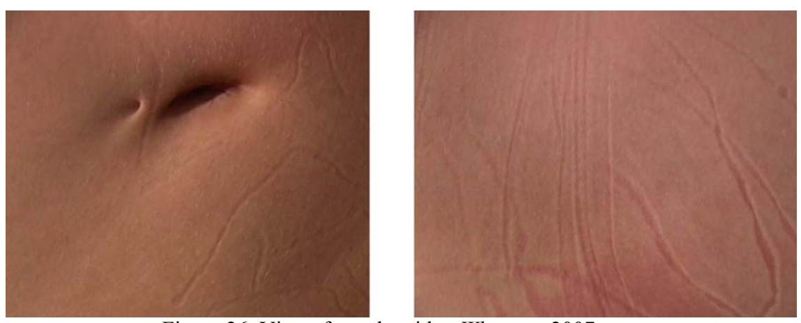
Figure 26, Views from the video Whereon, 2007

the marks in a gradual and concealed way, however eventually makes it clear how the marks have changed in one minute.