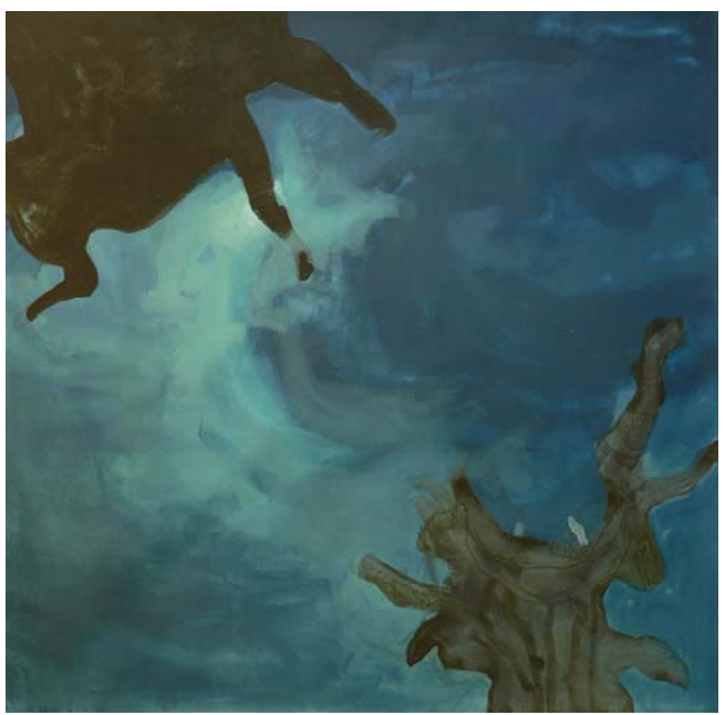
Figure 2, Untitled, 2007

This indefinability prevents the viewer from fixing the image to a single, well defined reality. My aim is to leave a space of endless possibilities within the image. Even though exhibition of an image brings about an insistence of a certain kind of reality, I would rather have images which can fit in different realities of different spectators. In other words, I aim to create images in such a way that the 'blind' space contained within them makes several interpretations possible.