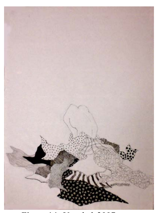
Figure 14, Untitled, 2007

Consequently, for the present time, I try to include concealed in my images through the use of the figure and ground relation and the idea of mark. I consider these concepts to be key points in my works.