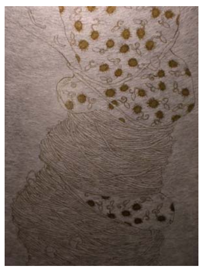
Figure 10, View from the exhibition in Proje 4L, 2007

The element of transition is also there in my drawings. The way my drawings are exhibited is very crucial for revealing their potential. In this sense, I exhibit them in two different ways.