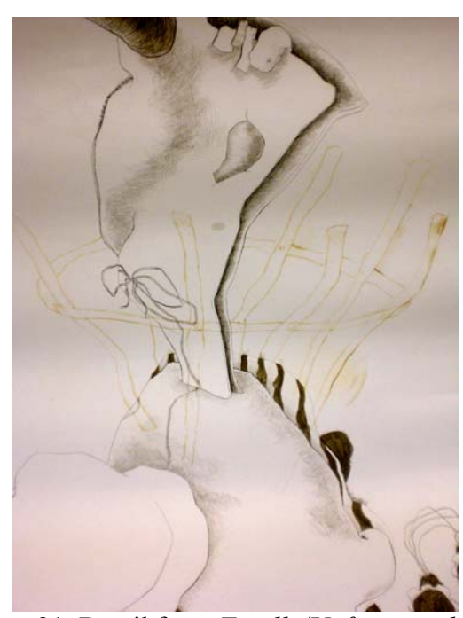
Figure 21, Detail from Finally/Unfortunately 4, 2006

In the drawings I made with the invisible lemon juice and visible brown ink, my aim is also to propose a figure ground relationship different than a binary opposition. In a binary opposition, the privileged figure and the subordinated ground are strictly separated. In these works, however, the ground is not a left-over. It is not a part of the drawing which is not worth looking at, but space which conceals something inside. I want to draw the viewer's attention to the ground as I would like to break the visual tradition which prioritizes the figure.