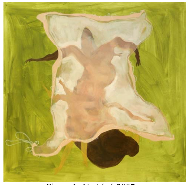
Figure 1, Untitled, 2007

The reason why some of the aspects or parts of my images are concealed is that I aim to create a space that can be impregnated with different interpretations each time a different spectator comes in.