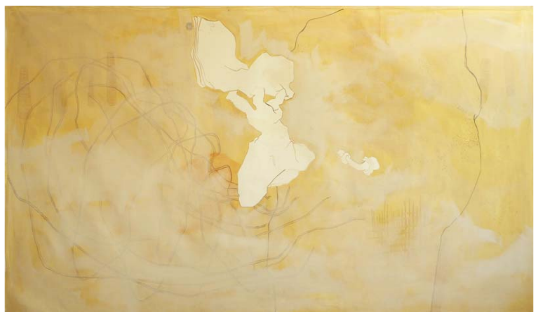
Figure 8, Untitled, 2007

I also intentionally leave some forms and figures on the canvas unpainted, so that these unpainted areas constitute the figures. In contrast to what is expected, I create and develop the figure out of the ground. Figure arises from the lack of paint. Therefore, the figure is not made, it exists through its absence.