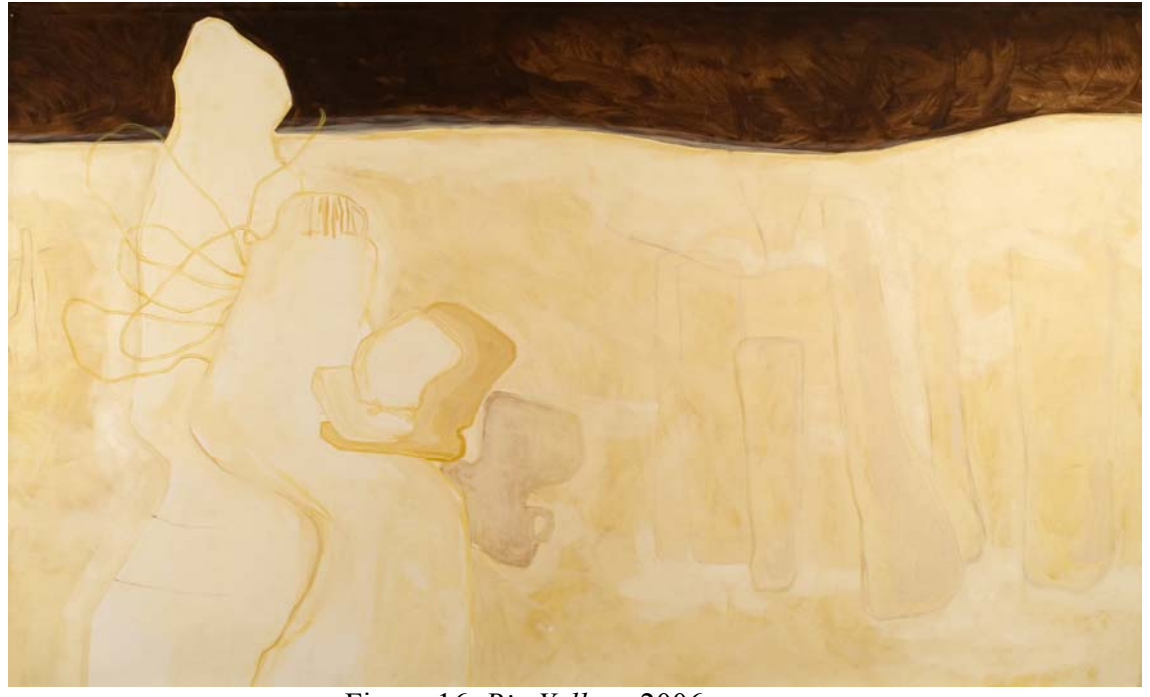
Figure 16, Big Yellow, 2006

Essentially, he conceived them [archetypes] to be innate neuropsychic centres possessing the capacity to initiate, control, and mediate the common behavioural characteristics and typical experiences of all human beings. Thus, on appropriate occasions, archetypes give rise to similar thoughts, images, mythologems, feelings, and ideas in people, irrespective of their class, creed, race, geographical location, or historical epoch. An individual's entire archetypal endowment makes up the collective unconscious, whose authority and power is vested in a central nucleus, responsible for integrating the whole personality, which Jung termed the Self. (Stevens, 48)