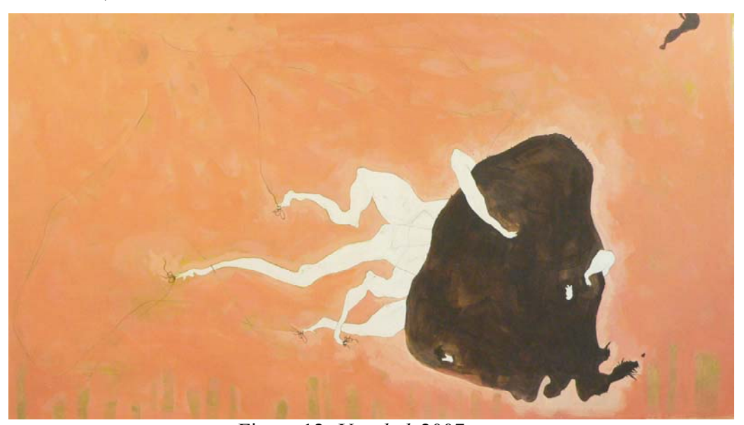
Figure 12, Untitled, 2007

Another critical characteristics of my works which is vital for the concealment, is the element of mark. Generally I paint on the canvas after I draw on it. I make the drawings almost invisible by covering them with paint. I use brush strokes leaving only some implications of the original drawings. Through these semi-visible drawings and brush strokes, I want to imply the time the paintings were made. These drawings and brush strokes are the marks of the past. In other words, I prefer to leave the mark of the imperfect and corporeal hand on my paintings which is the painting's potential of reference to the past, bringing the mark of a past to the present. I think that, Francis Bacon's statement is very close to my approach in terms of understanding the notion of mark: "I want my paintings to seem as though people passed through them. Appearance of the mark left by human existence, exactly like a snail that leaves traces." (Bacon in Altınel, 47)