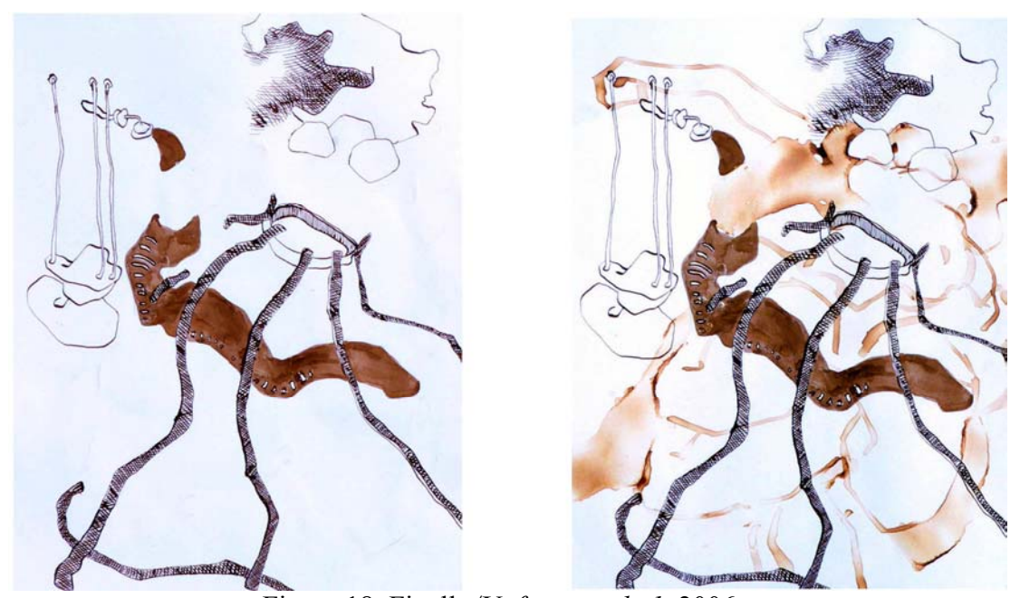
Figure 18, Finally/Unfortunately 1, 2006

I draw with lemon juice and brown ink on paper. Lemon juice drawings/marks are invisible at first, only the brown ink drawings can be seen. In about two months, the lemon juice drawings start to become visible. They turn out to be a very light yellow which becomes darker and darker as time passes. The period which is needed for the revelation depends on the weather. If it is cold, the revelation occurs slowly and vice versa.