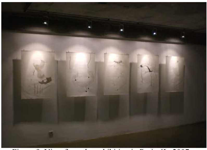
Figure 9, View from the exhibition in Proje 4L, 2007

In the painting (Figure 8) above the white figure in the centre is not painted. The ground is painted, whereas the figure is the area left-over by the ground itself. I try to transmit some attributes of the figure to the ground and vice versa which I believe is a way to create a transition.