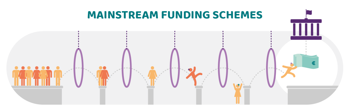
RESTRICTIVE CRITERIA | LACK OF TRANSPARENCY | HEAVY BUREAUCRACY

A report from the European Union Agency for Fundamental Rights (FRA) indicated that out of 400 CSOs consulted across the EU, 60% experienced difficulty securing funding in 2020, despite some efforts to improve financing frameworks in several Member States.<sup>3</sup> The specific challenges related to the allocation of funds that CSOs reported were: competition with other CSOs for limited funds; limited administrative capacity to apply for funding; a lack of transparency and fairness in funding allocation; and restrictive eligibility criteria. CSOs also highlighted pandemic-related funding issues such as 'the diversion of public funds to other priorities, a decrease in private donations and the inability to organise fundraising events, and a decline in in-kind contributions such as volunteering'. <sup>4</sup> Similar to RESISTIRÉ's findings, FRA's research also highlighted the discriminatory and restrictive funding practices that exist in a number of EU countries and that are especially a problem for CSOs focusing on gender equality and LGBTQI+ rights, as well as those working with migrant communities and religious minorities.