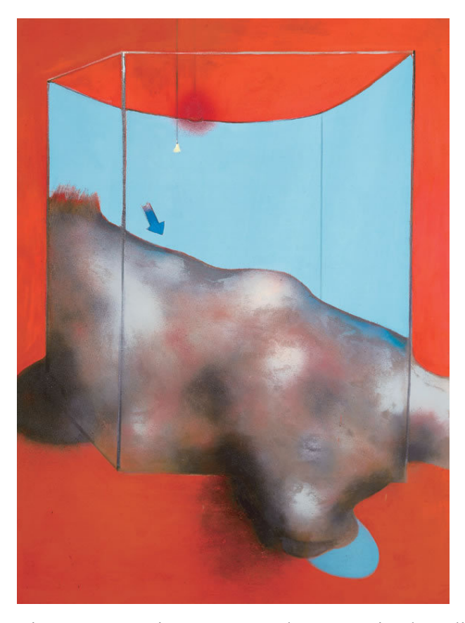
Figure 2: Francis Bacon. Sand Dune, Mixed media on canvas, 1983

In some of Bacon's paintings, the figure is an indescribable mass of flesh that carries the resemblances of human yet it can also be seen as non-human. As in Sand Dune, the viewer observes a bulk of flesh despite the fact that the painting's name refers to sand. Similar to Bacon's approach, I paint masses of flesh, with loose resemblances of a human body. As explained in Chapter 2, my inspirations are the images of bodily deformations that are formed after amputation of a limb or have occurred with the development of a tumor. These directory images hand me the hints of a body's regenerative aspects and its ability to differ in shape. Thus, on canvas, I aim to build my fictional non-human bodies.