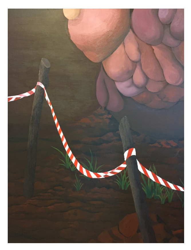
Figure 1: Detail from the painting Wet Nurse, oil on canvas, 2018

In the painting Wet Nurse (Figure 1), the non-human body on a landscape is painted in a realist style. To flatten the illusion of reality, a plastic barricade tape is included in the painting as an anachronic object, creating a contradiction for the viewer. Plastic barricade tape belongs to contemporary times, while the medium itself and other signifiers refer to the past.