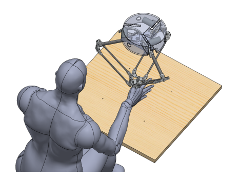
Fig. 1 . Illustration of the task workspace. Four target locations are placed on the board, each at 200 mm distance.

Before the experiments, all subjects performed a pre-flight phase of eight trials (i.e., reaching movements) without any force-field to get familiar with the task workspace and trial flow. As part of the force-field adaptation task, each subject performed 200 trials in total, which were divided into three blocks of 40, 80, and 80 trials. Within each of these blocks, there were equal number of trials per target location. After the task, subjects also performed a washout phase of 20 trials which involved no force-field. Additionally, throughout the experiment, four blocks of five minute resting-state EEG recordings were performed; first resting-state recording before the force-field adaptation task, second recording after the