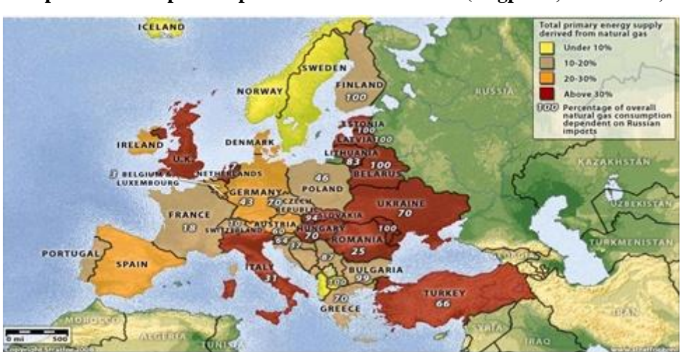
Map 5: The European Dependence on Natural Gas (Lngpedia, 27/06/2009)