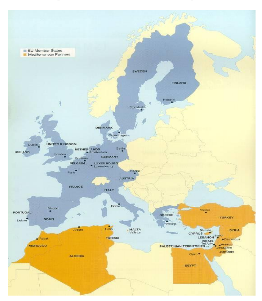
Map 2: The Euro-Mediterranean Partnership (EU Website)