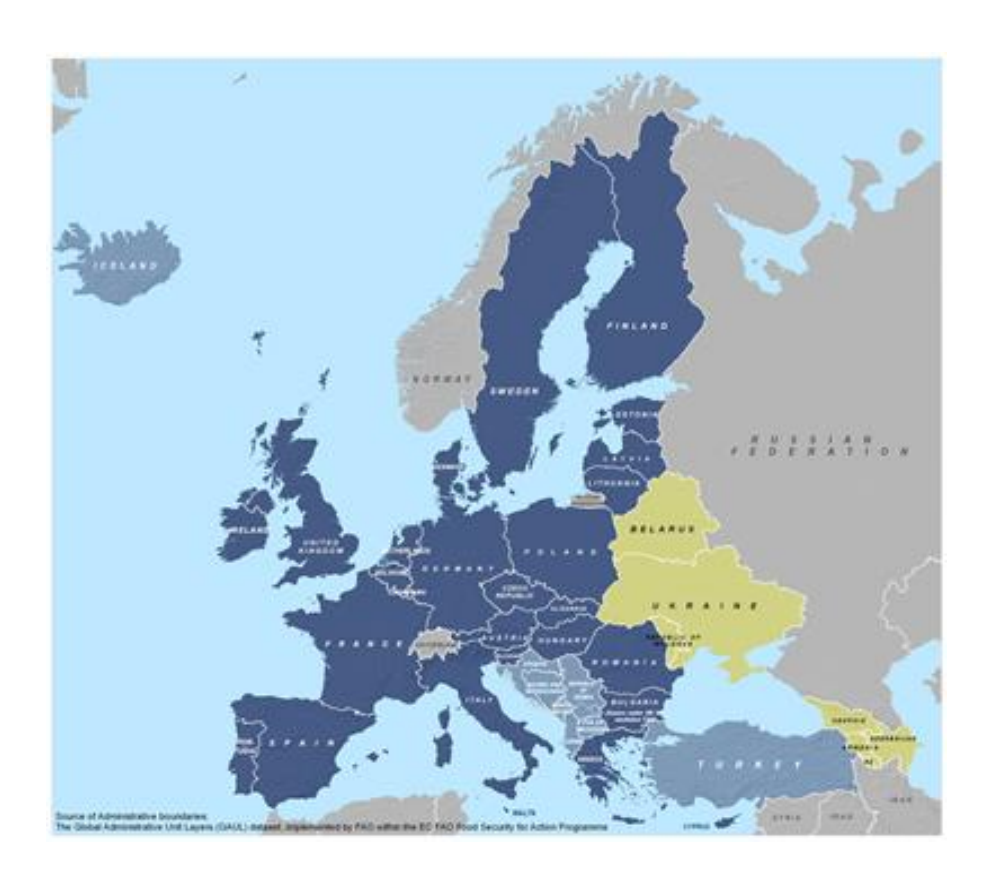
Map 4: The Eastern Partnership (EEAS Website, Eastern Partnership)

region and the Union. Although these countries showed their willingness to become closer to the EU with the reforms they made in political, social and economic terms, the conflict that took place in Georgia in 2008 was a good evidence that the EU's security was beginning outside its borders and that it was needing more than what the Black Sea Synergy offered. For this reason, the European Commission, in order to enhance its relations with those countries, decided to sign deeper free trade agreements that will offer the partners to go to a deeper engagement and integration with the EU and they will provide crucial opportunities like strengthened democracy, good governance, environment protection, stability, social and economic development as well as easier travel through gradual visa liberalization (EEAS Website, Eastern Partnership).