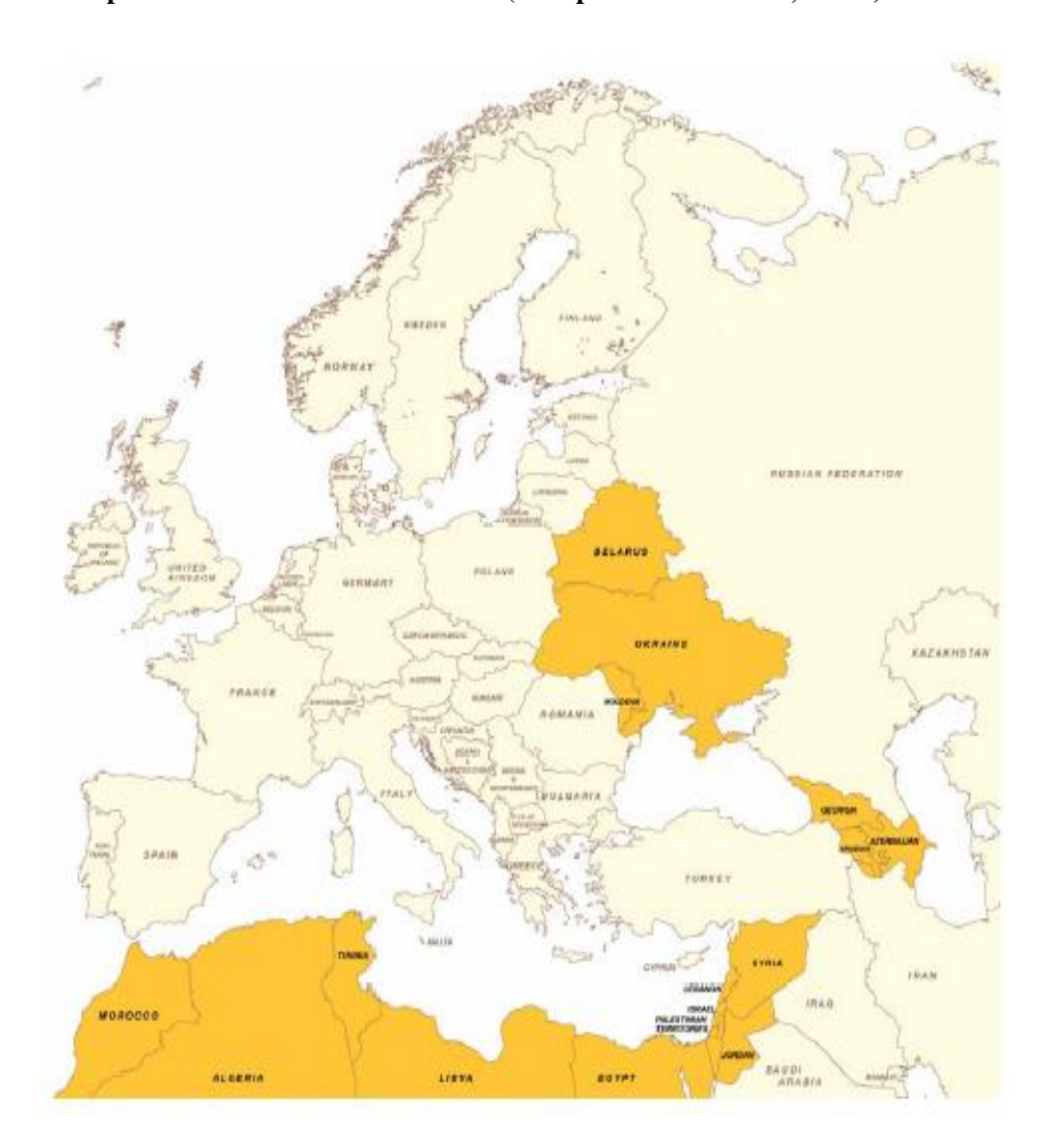
Map 1: The ENP Partner Countries (European Commission, 2007c)

The European Neighborhood Policy is created to share the benefits of the eastern enlargement and to prevent the emergence of new dividing lines between the enlarged EU and its neighbors by strengthening stability, prosperity as well as shared values and the rules of law for the security. The policy is designed to offer the neighbors the chance to participate in EU activities by cooperating in political, economic and cultural terms.