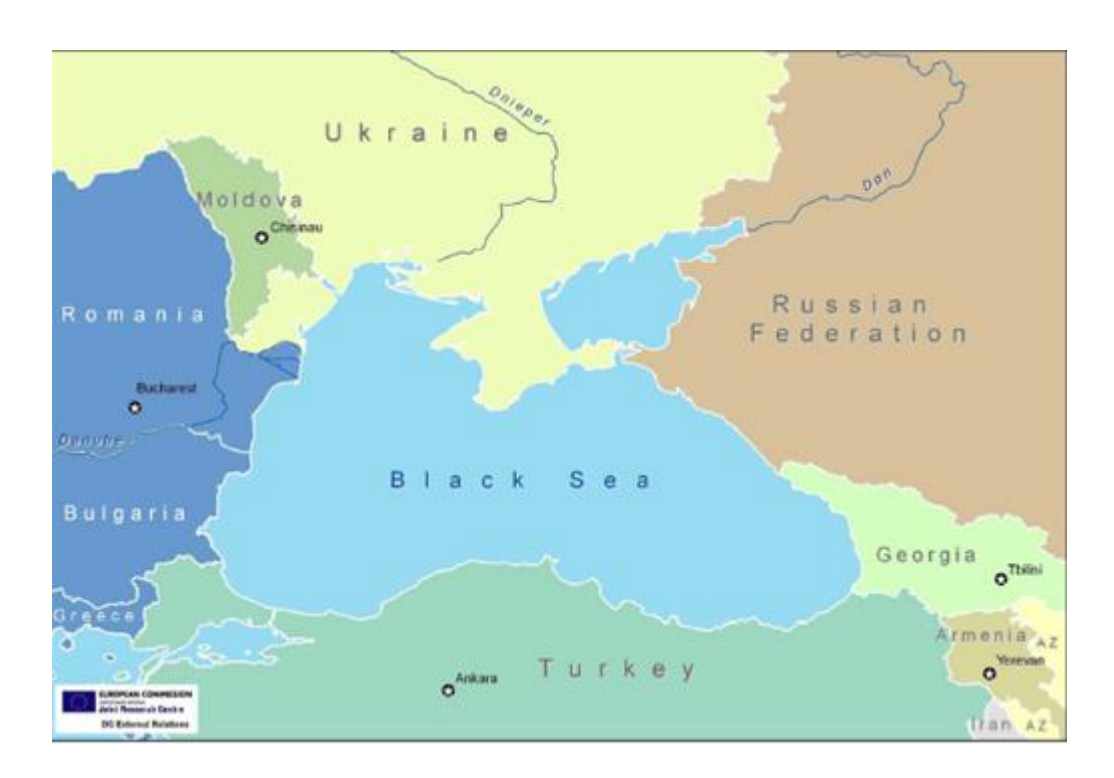
Map 3: The Black Sea (European Commission, 2008)

Corridor for Europe-Caucasus-Asia launched in 1993), and INOGATE (Interstate Oil and Gas Transportation launched in 1995).