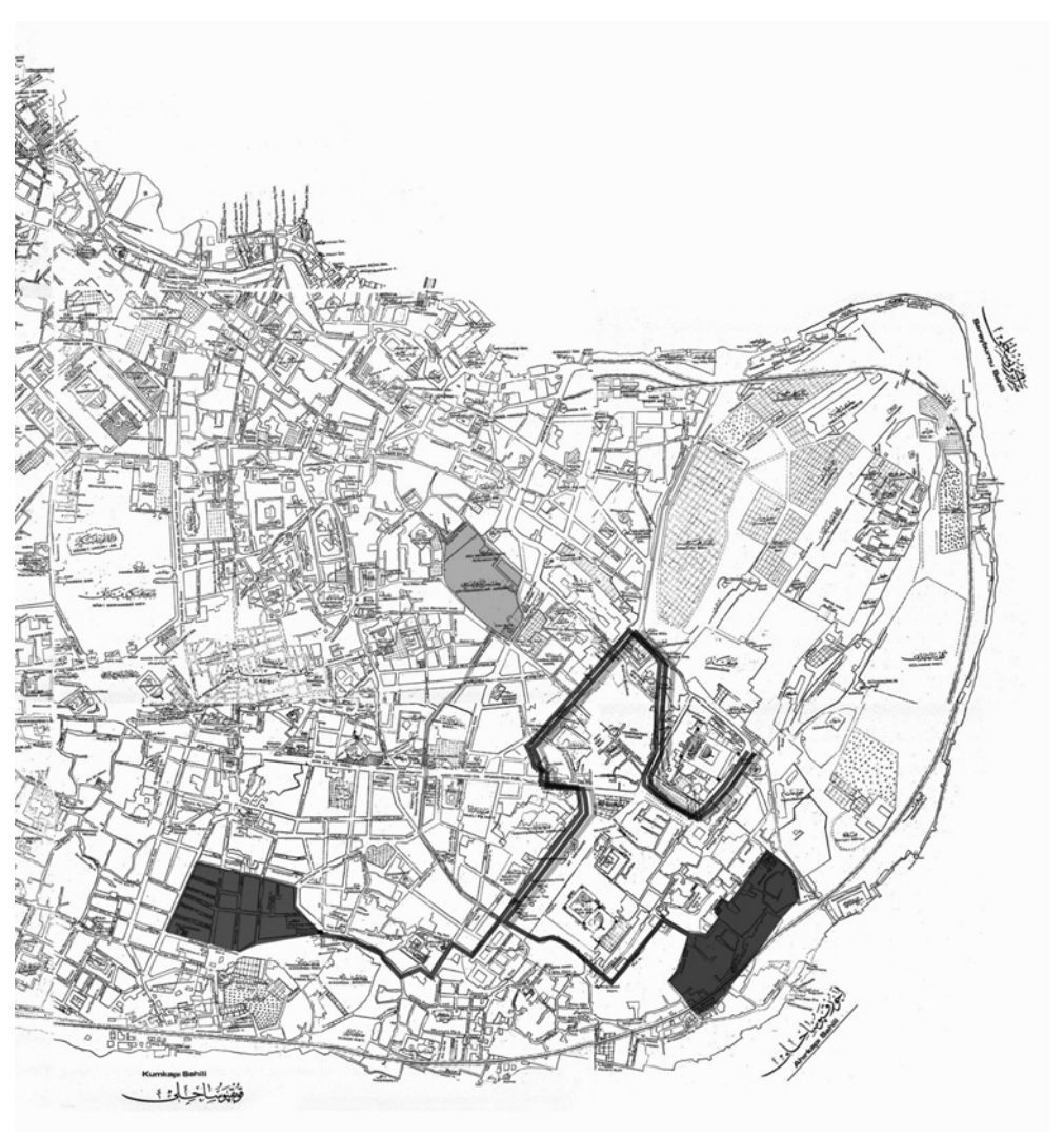
Figure 1. Map showing the routes of the 1724 processions. Reproduced from: Ekrem Hakkı Ayverdi, 19. Asırda İstanbul Haritası (İstanbul 1978).