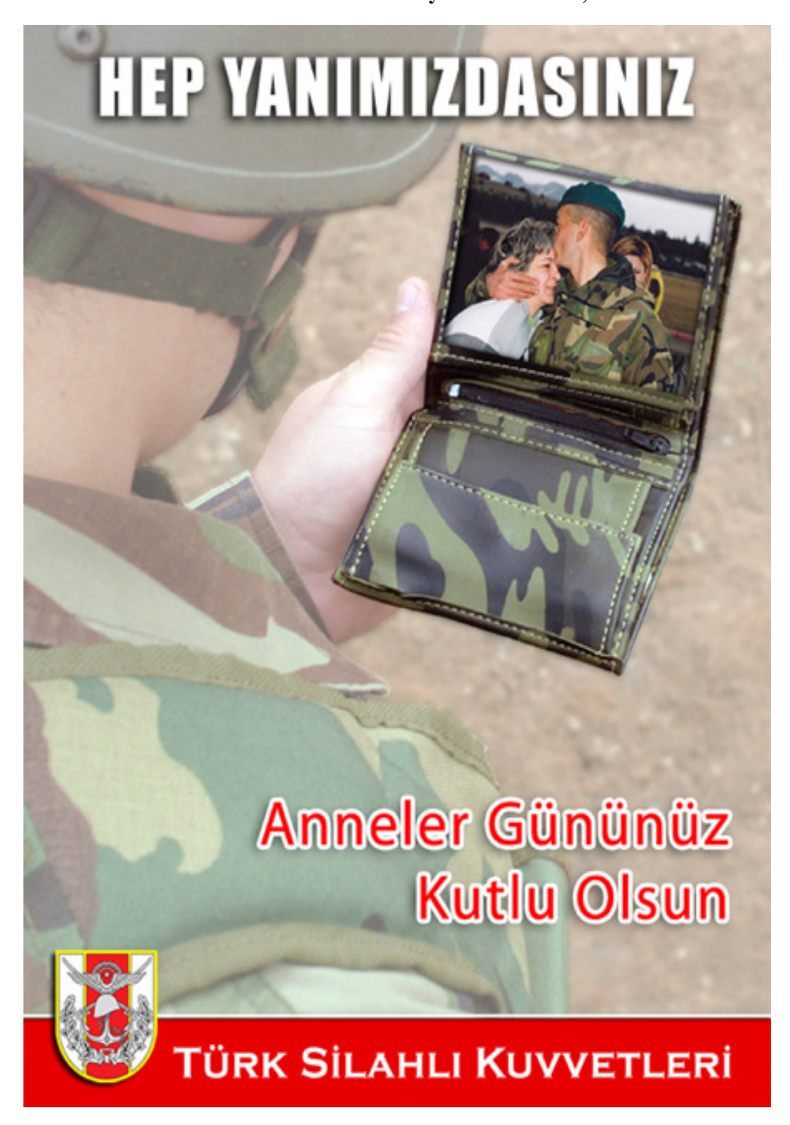
APPENDIX K: Mother's Day Posters of TAF, 2007

"You are always with us. We celebrate your Mother's Day."