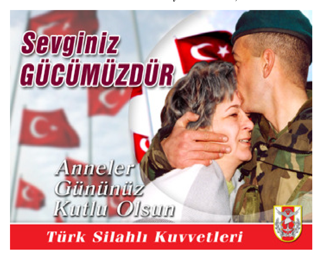
APPENDIX L: Mother's Day Posters of TAF, 2008

"Your love is our power. We celebrate your Mother's Day."