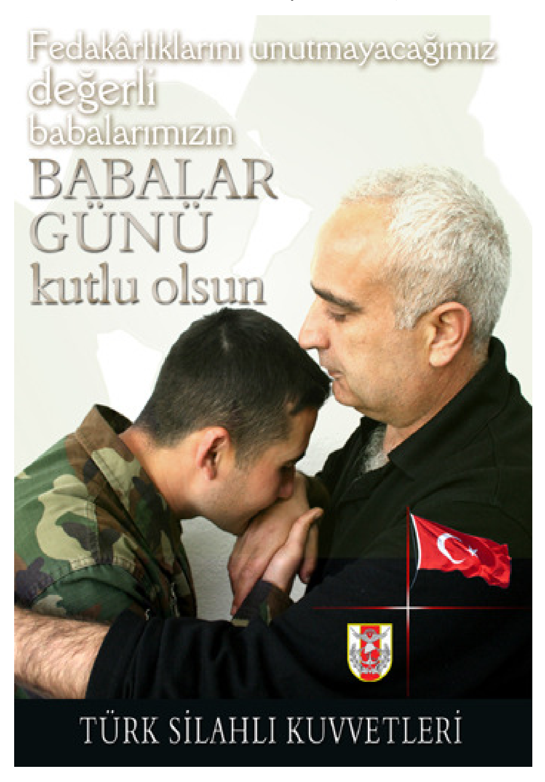
APPENDIX O: Father's Day Posters of TAF, 2008

"We celebrate the Father's Day of our fathers whose sacrifices we will never forget."