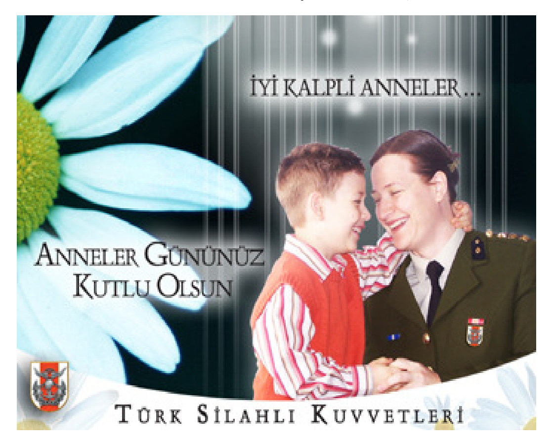
APPENDIX M: Mother's Day Posters of TAF, 2009

"Kind hearted mothers; we celebrate your Mother's Day."