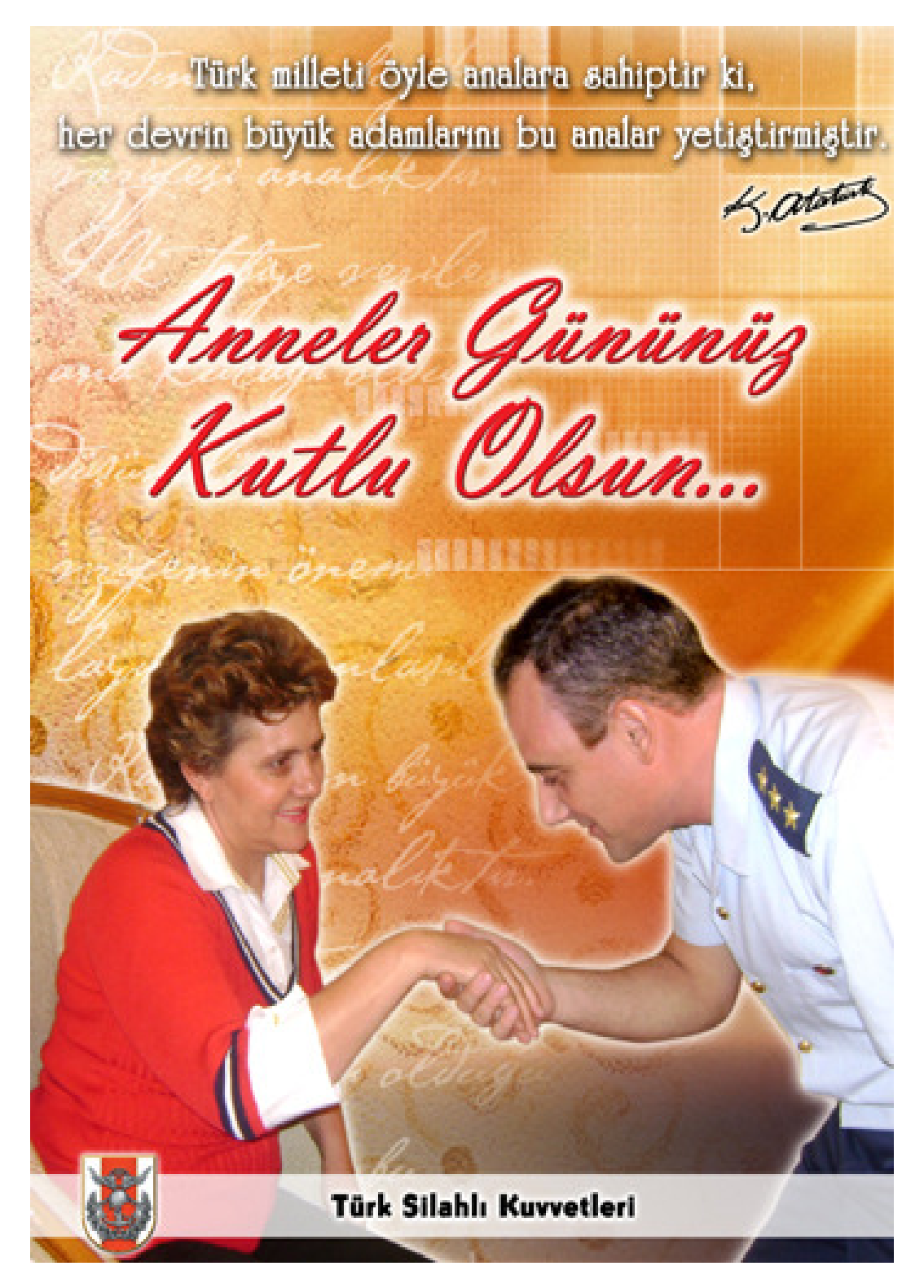
"The most significant men of every period have been raised by the mothers of the Turkish nation. We celebrate your Mother's Day."