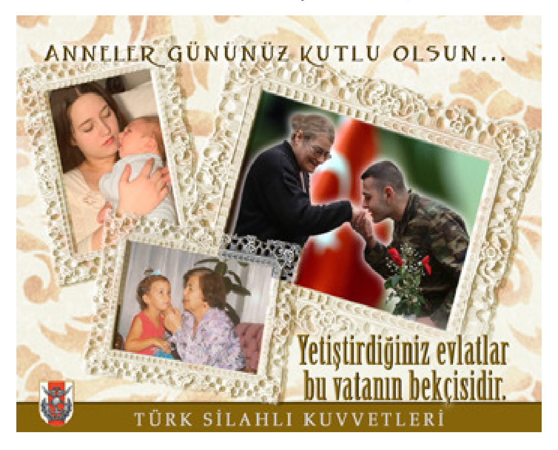
APPENDIX M: Mother's Day Posters of TAF, 2009

"The children you have raised are the protectors of this homeland. We celebrate your Mother's Day."