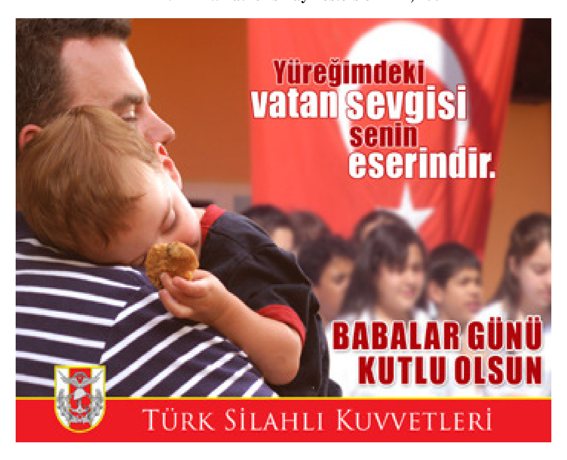
APPENDIX N: Father's Day Posters of TAF, 2007

"The love of the homeland in my heart is your creation. We celebrate Father's Day."