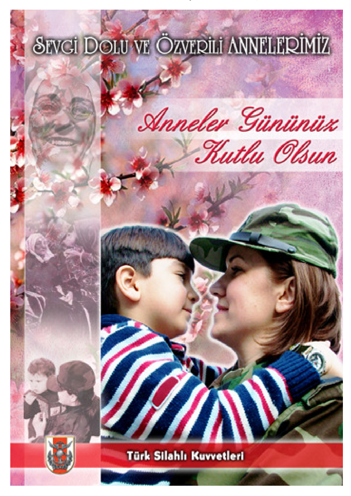
APPENDIX M: Mother's Day Posters of TAF, 2009

"Our loving and self-sacrificing mothers, we celebrate your Mother's Day."