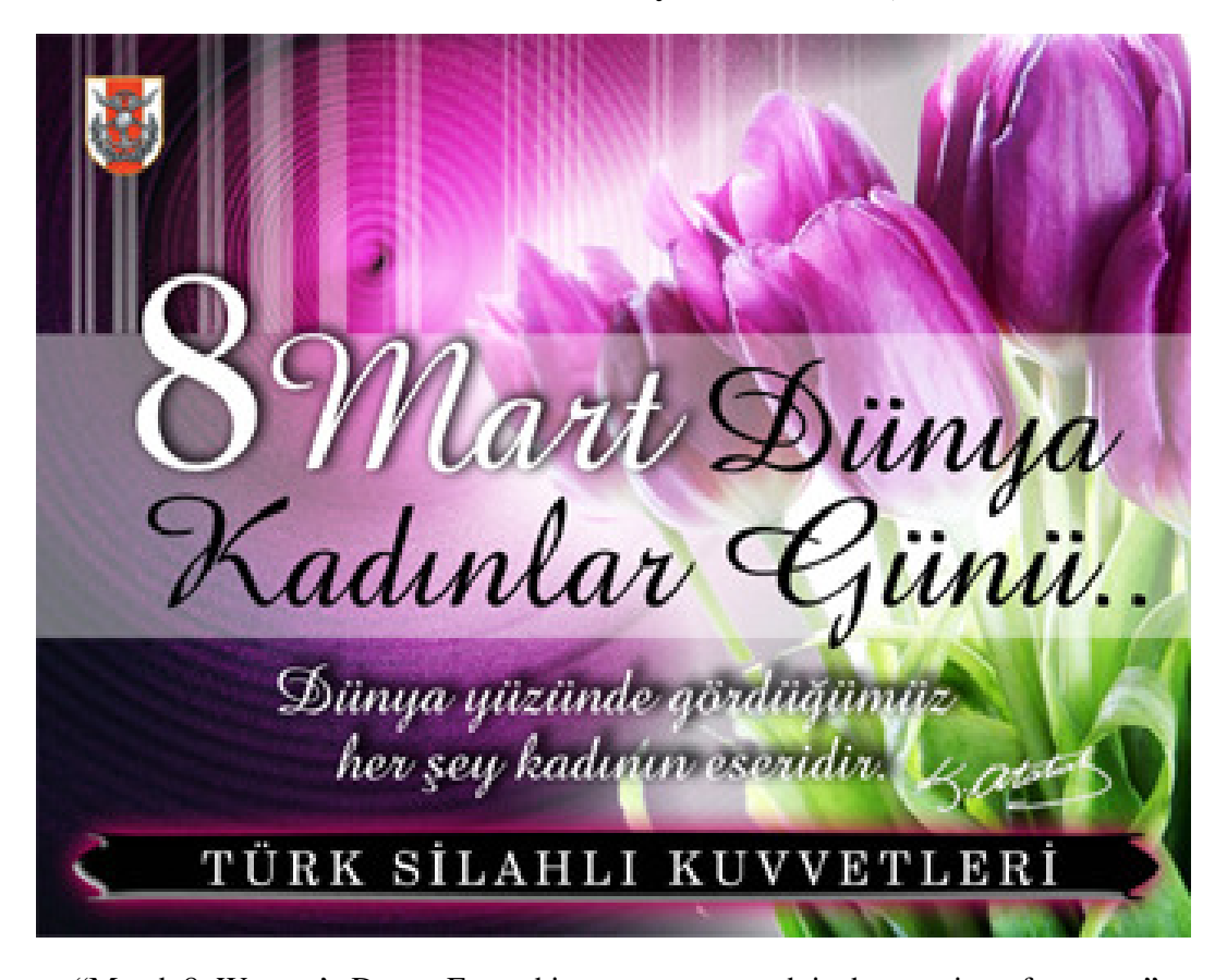
APPENDIX J: Women's Day Posters of TAF, 2009

"March 8, Women's Day... Everything we see on earth is the creation of women."