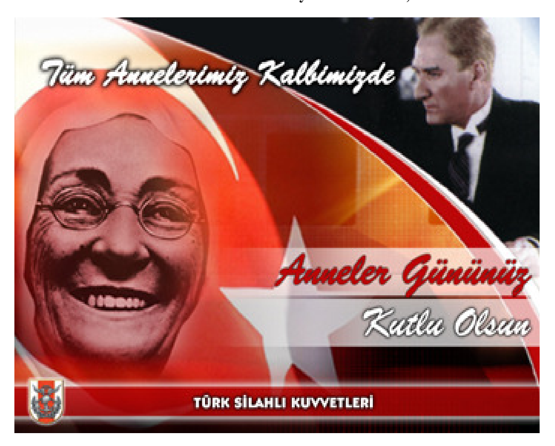
APPENDIX M: Mother's Day Posters of TAF, 2009

"All our mothers are in our hearts. We celebrate your Mother's Day."