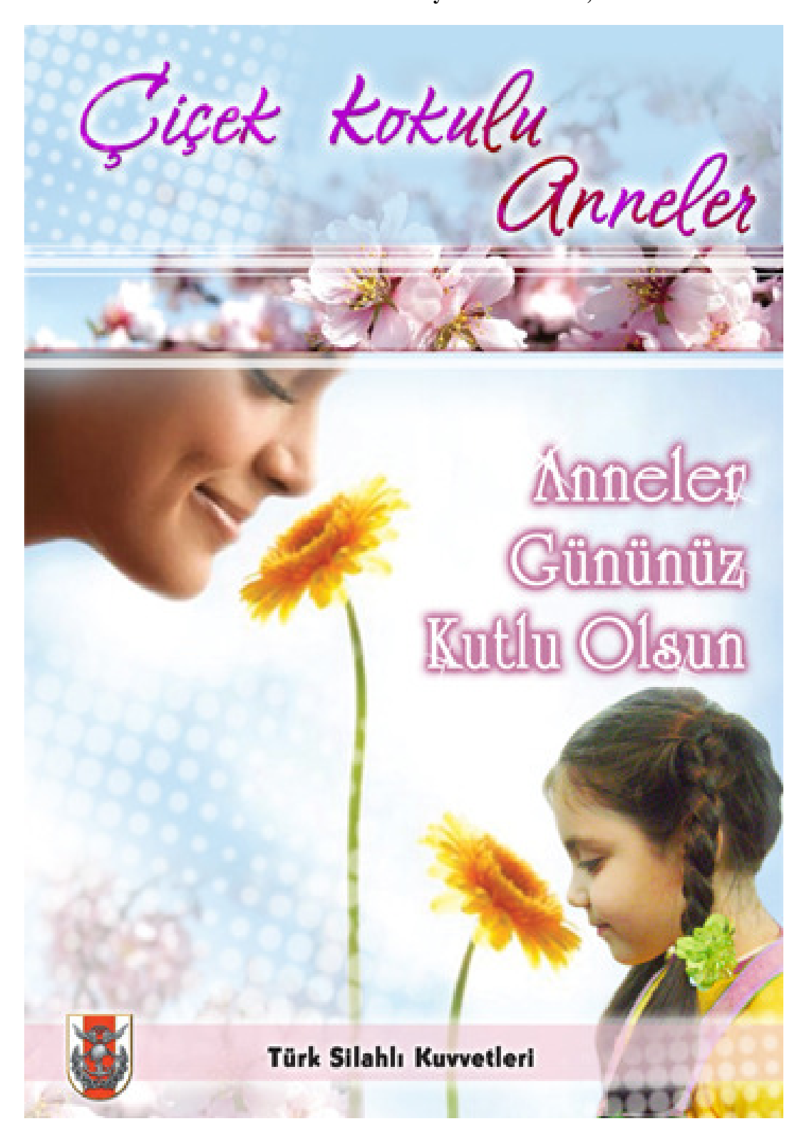
APPENDIX M: Mother's Day Posters of TAF, 2009

"Mothers with a scent of flowers, we celebrate your Mother's Day."