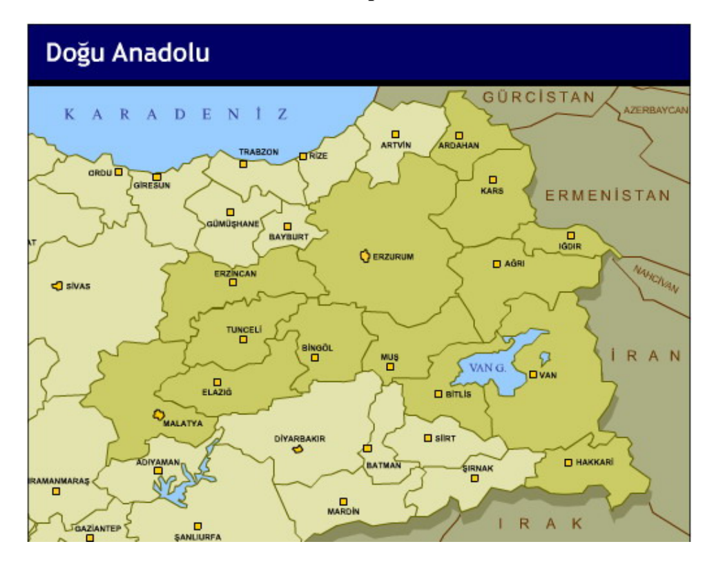
APPENDIX F: The Map of Eastern Anatolia