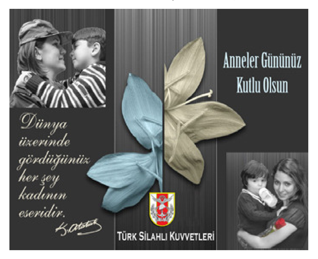
APPENDIX L: Mother's Day Posters of TAF, 2008

"Everything you see on earth is the creation of women. We celebrate your Mother's Day."