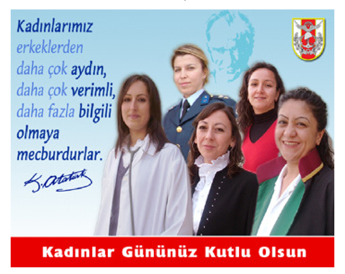
APPENDIX I: Women's Day Posters of TAF, 2008

"Our women have to be more intelligent, more productive, more knowledgeable than men. We celebrate your Women's Day."