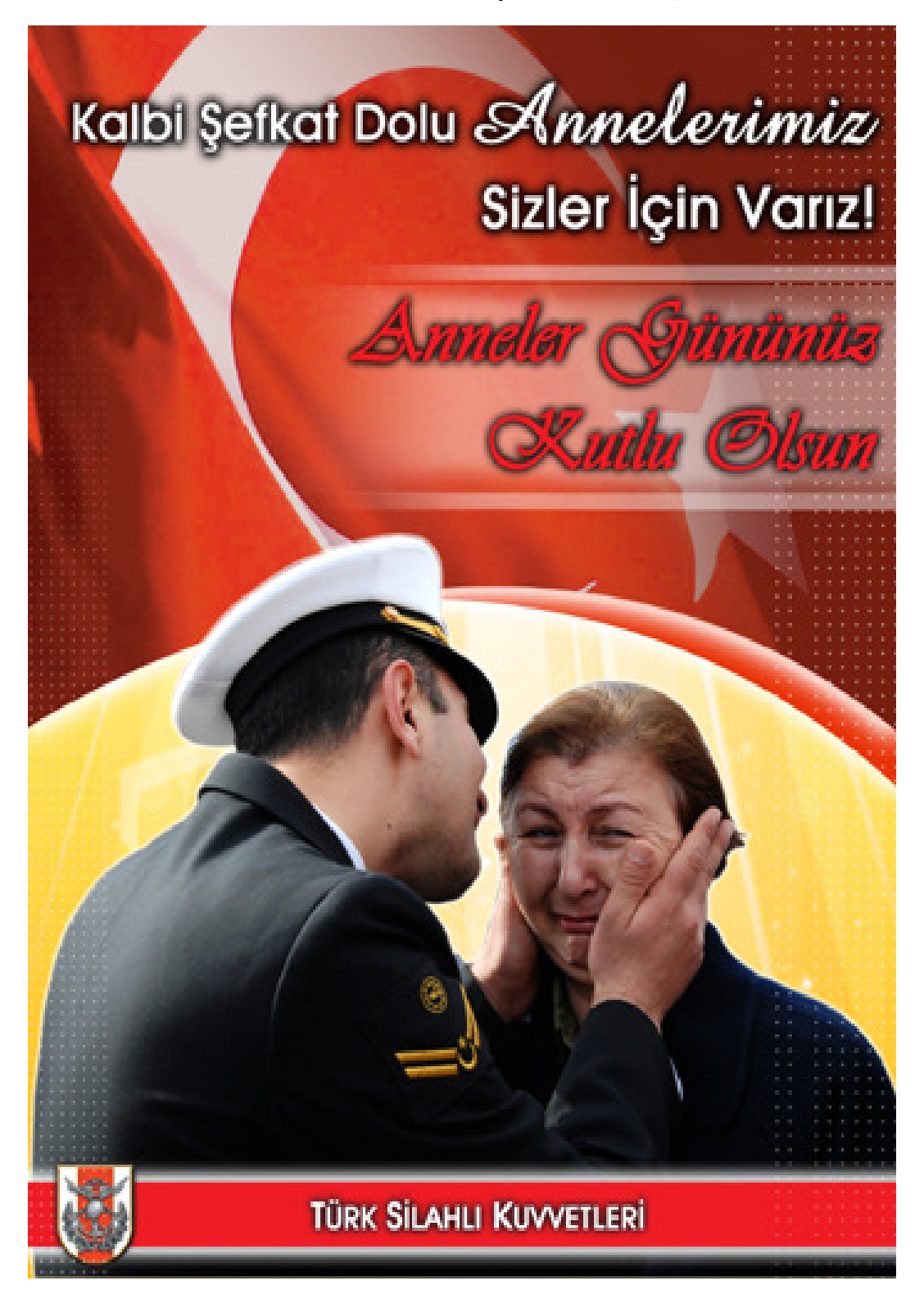
APPENDIX M: Mother's Day Posters of TAF, 2009