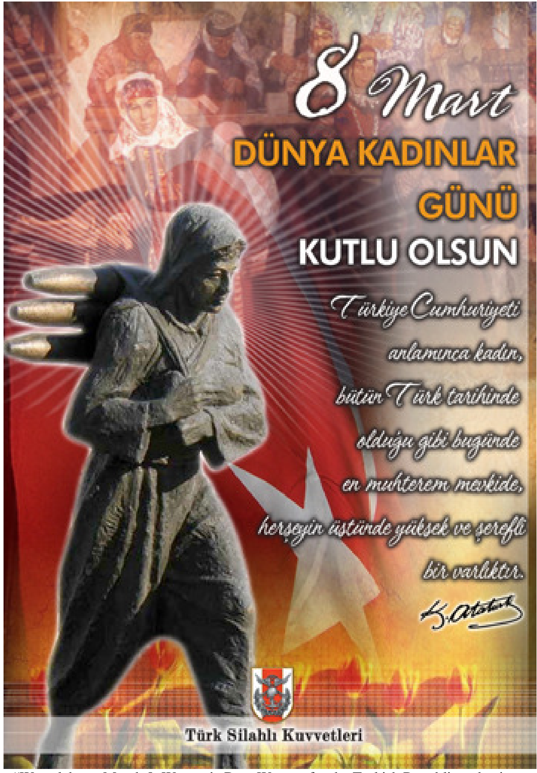
APPENDIX J: Women's Day Posters of TAF, 2009

"We celebrate March 8, Women's Day. Woman for the Turkish Republic today is an exalted and honorable being in the most respected state, just like she has been throughout Turkish history."