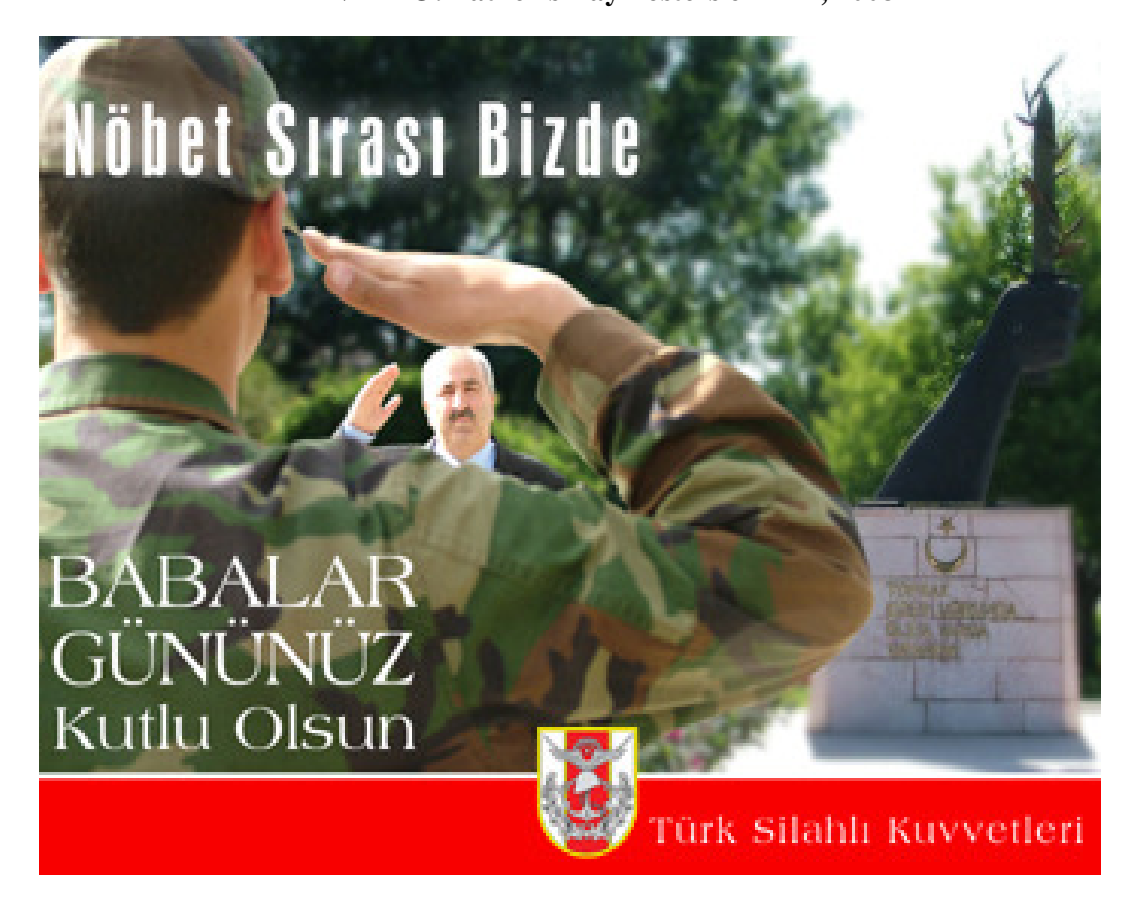
APPENDIX O: Father's Day Posters of TAF, 2008

"It is our turn of duty. We celebrate your Father's Day."