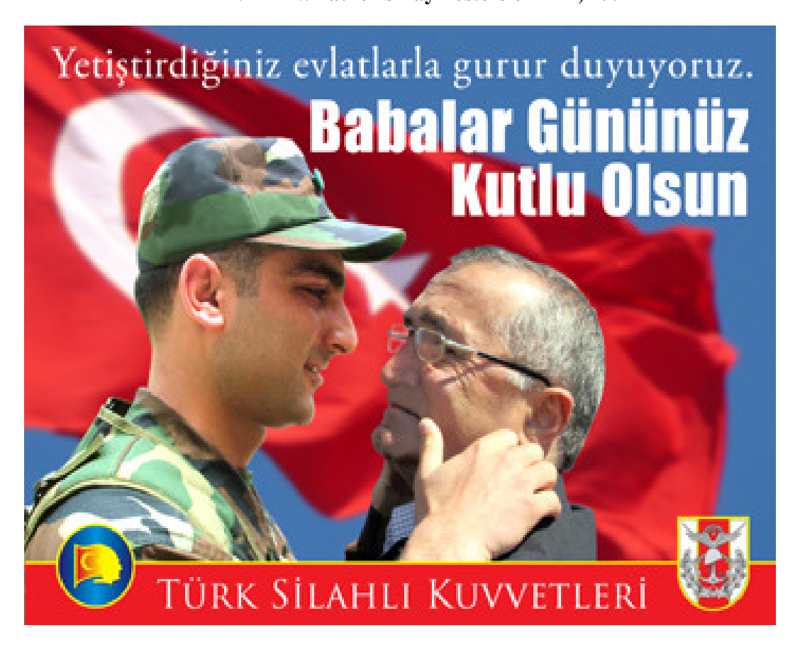
APPENDIX N: Father's Day Posters of TAF, 2007

"We are proud of the sons you have raised. We celebrate your Father's Day.