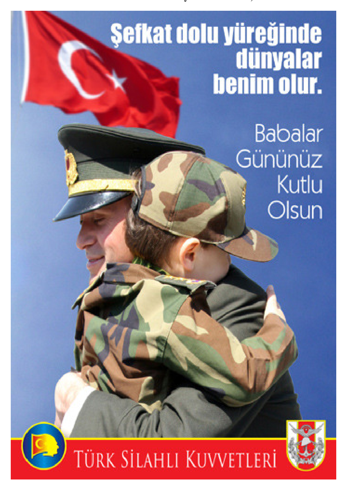
APPENDIX N: Father's Day Posters of TAF, 2007

"How happy I am in your compassionate heart. We celebrate your Father's Day."