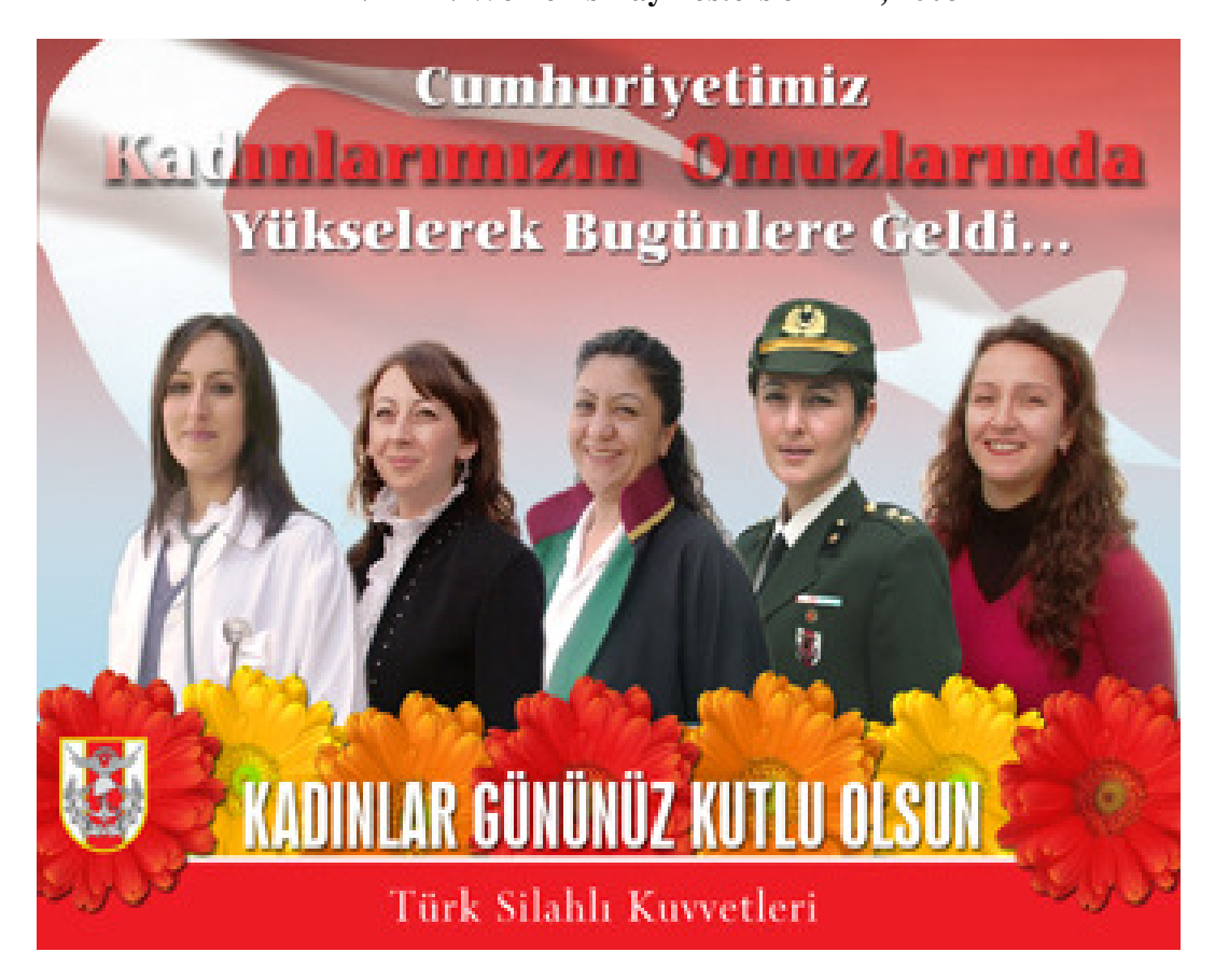
APPENDIX I: Women's Day Posters of TAF, 2008

"Our republic has reached its present state by developing on the shoulders of our women."