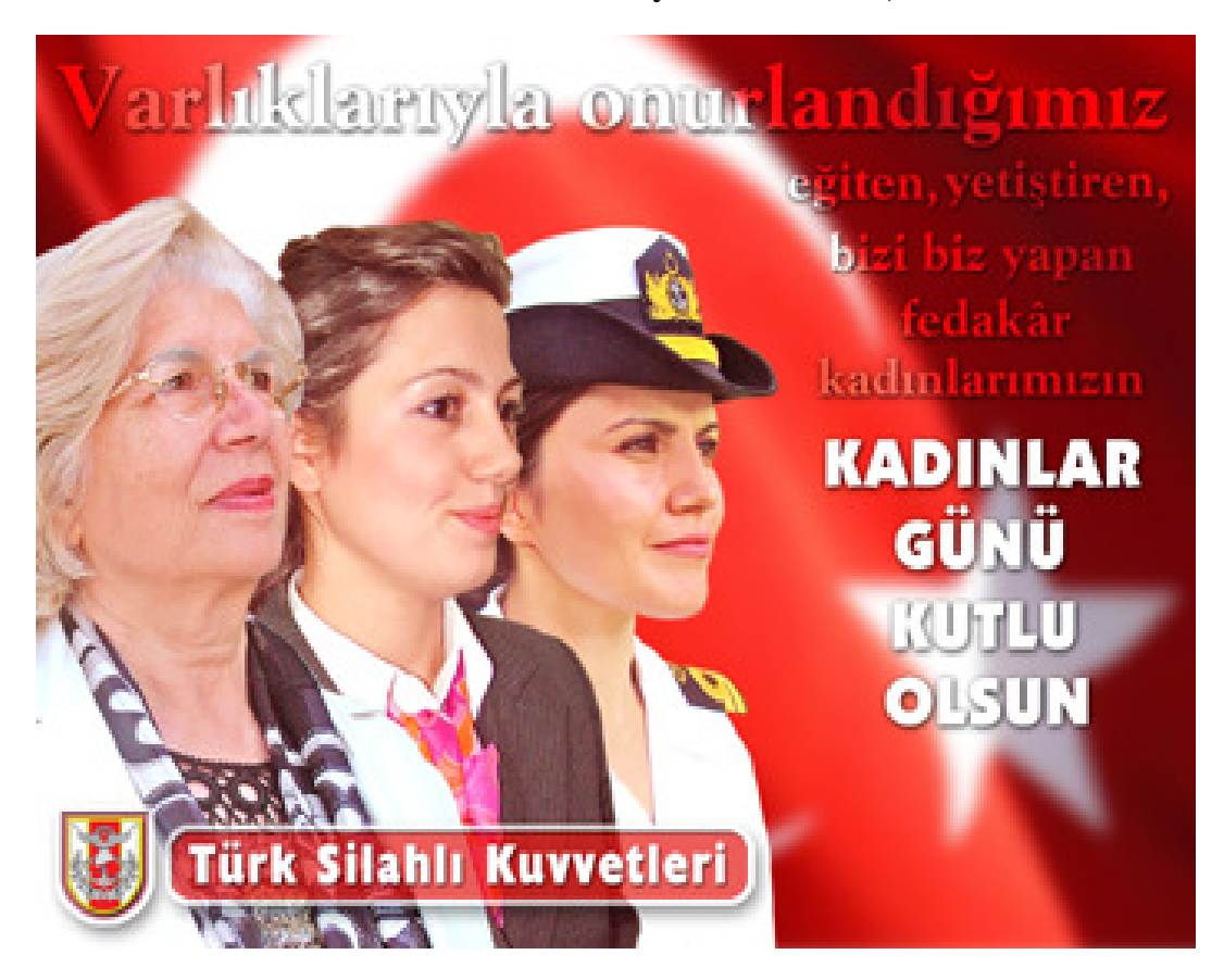
APPENDIX I: Women's Day Posters of TAF, 2008

"We celebrate the Women's Day of our self-sacrificing women who have educated, raised, made us who we are and with whose existence we are honored."