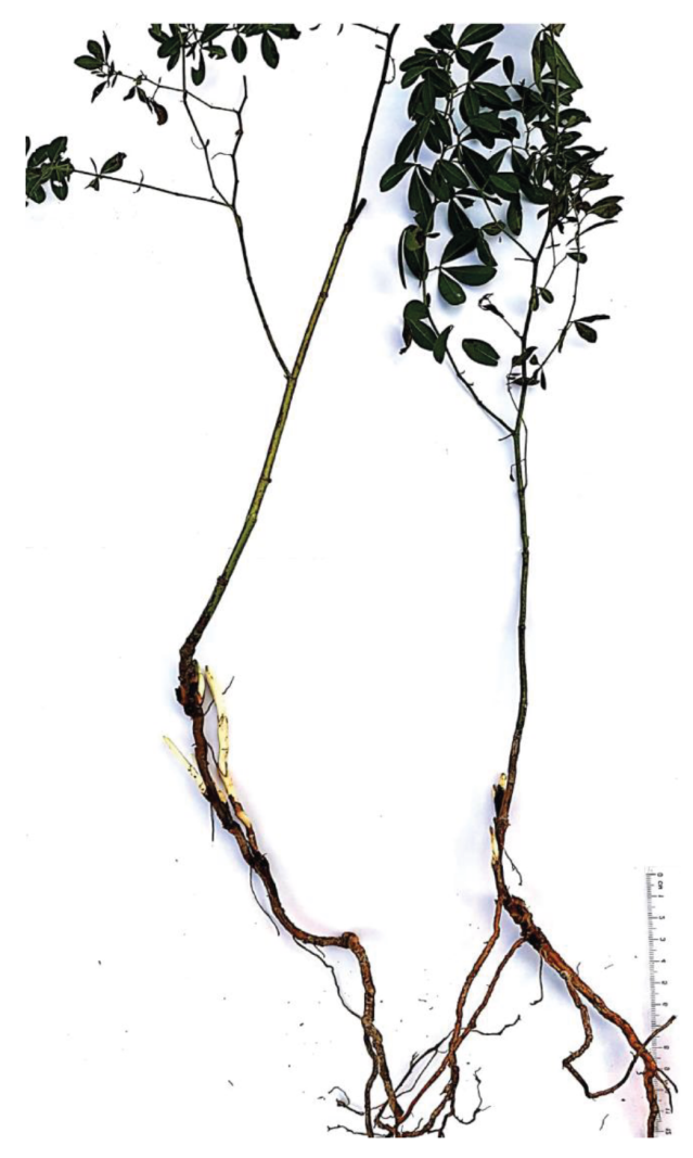
Figure 1 . Rhizomes of V. turcica with adventitious roots planted at Nezahat Gökyiğit Botanical Garden in 2016.

measured nutrients will be constant during the growth period (Dahnke and Olson, 1990; Marschner, 2012; Sahrawat, 2016). The analysis of soil status is especially useful in the assessment of nutrient uptake status, which is essential for in vivo conservation and soil mineral management on the application of fertilizer. Soil fertility is critical for crop growth and is assessed in terms of different parameters including soil nutrient availability (Stockdale et al., 2002).