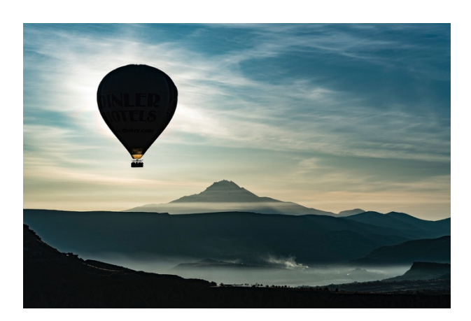
Figure 3: Cappadocia as seen from a hot air balloon

I would like to mention two rather unusual tools some photographers prefer to take aerial photos from relatively closer distances to ground level. The first one is a very tall tripod called megamast that can reach the maximum height of 8,5 metres.