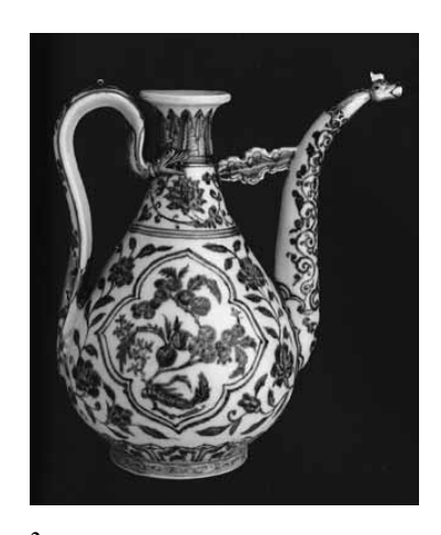
Blue-and-white porcelain ewer, China, early 15th century. Topkapı Palace Museum, Istanbul, 14/1410. After İstanbul'daki Çin Hazinesi (Istanbul: İş Bankası Kültür Yayınları, 2001), 95.

number of Chinese porcelains that she was given as part of her trousseau in 1675, the elder Hadice continued to collect on her own, and when she died in 1743 her collection comprised no fewer than 2,365 Chinese and twelve European pieces. <sup>11</sup> All were immediately sent to the Topkapı Palace. The younger Hadice, in contrast, developed a personal taste for porcelain from Saxony, Vienna, and France. When she died in 1822, hundreds of precisely identified pieces and sets of European porcelain were transferred to the Palace Treasury. Only four Chinese porcelain jars were amongst her collection. <sup>12</sup>