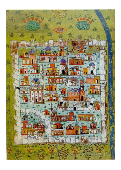
Figures 4, 5 & 6. Ottoman miniatures depicting Izmit (left), Eskisehir (middle) and Tatvan (right) by Matrakci Nasuh. (Images accessed: Sun Jun 7 18:29:12 2009 / URL: http://img260.imageshack.us)

The constitution of space involving multiple incompatible perspectives to be present in photos to be used, can be likened to Ottoman miniatures where various conflicting perspectives can co-exist. This diversity of perspectives takes us to the idea of "perspectivism" which, after Wikipedia, is "the philosophical view developed by Friedrich Nietzsche that all ideations take place from particular perspectives. This means that there are many possible conceptual schemes, or perspectives which determine any possible judgment of truth or value that we may make; this implies that no way of