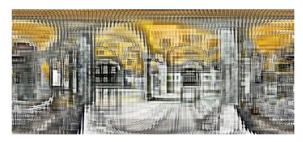
Figures 2 & 3. Left: 360-degree photo-mosaic. Photo: "Hagia Sophia #3" from "Places" series, Ahmet Elhan, 2008. Right: Gwon Osang's photomosaic sculptures.