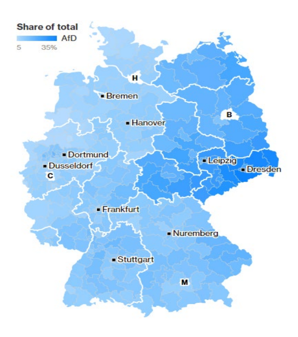
Figure 2.1: AfD's share of votes in Germany by area (West/East) in 2017 Federal Elections <sup>13</sup>