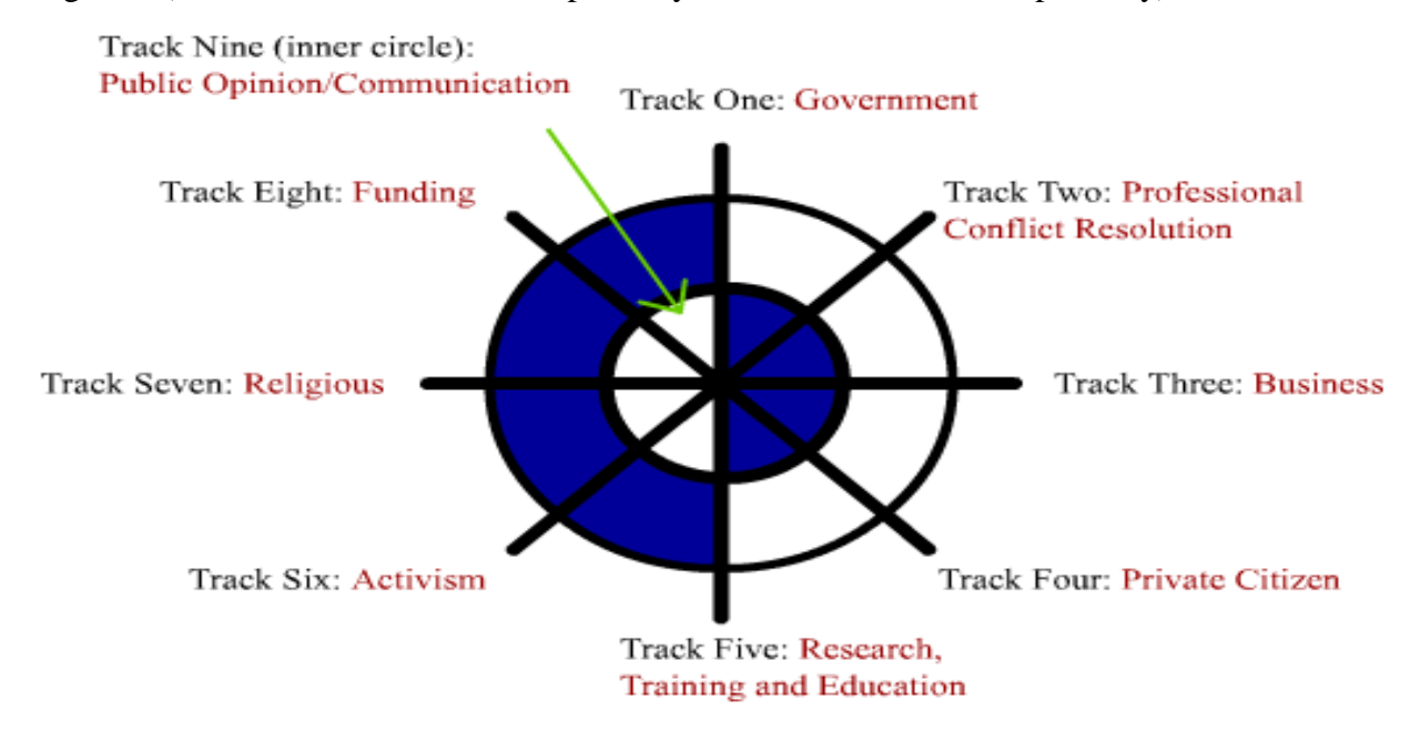
Figure 4 (Institute for Multi-Track Diplomacy, What is Multi-Track Diplomacy)

The newer and longer multi-track diplomacy approach expands the role of civil society actors and private initiatives. As it is shown in the diagram, on the contrary of using the order of importance process, each step and track has equal importance, and each of them has its own resources, capacity values and approaches (Diamond&cDonald, 1996). According to Diamond, no track can build peace by itself, and no one can be separated from each other either (Diamond, &cDonald, 1996). The advantage of multi-track diplomacy, each track specifically addresses the different dimension of conflict and its solution.