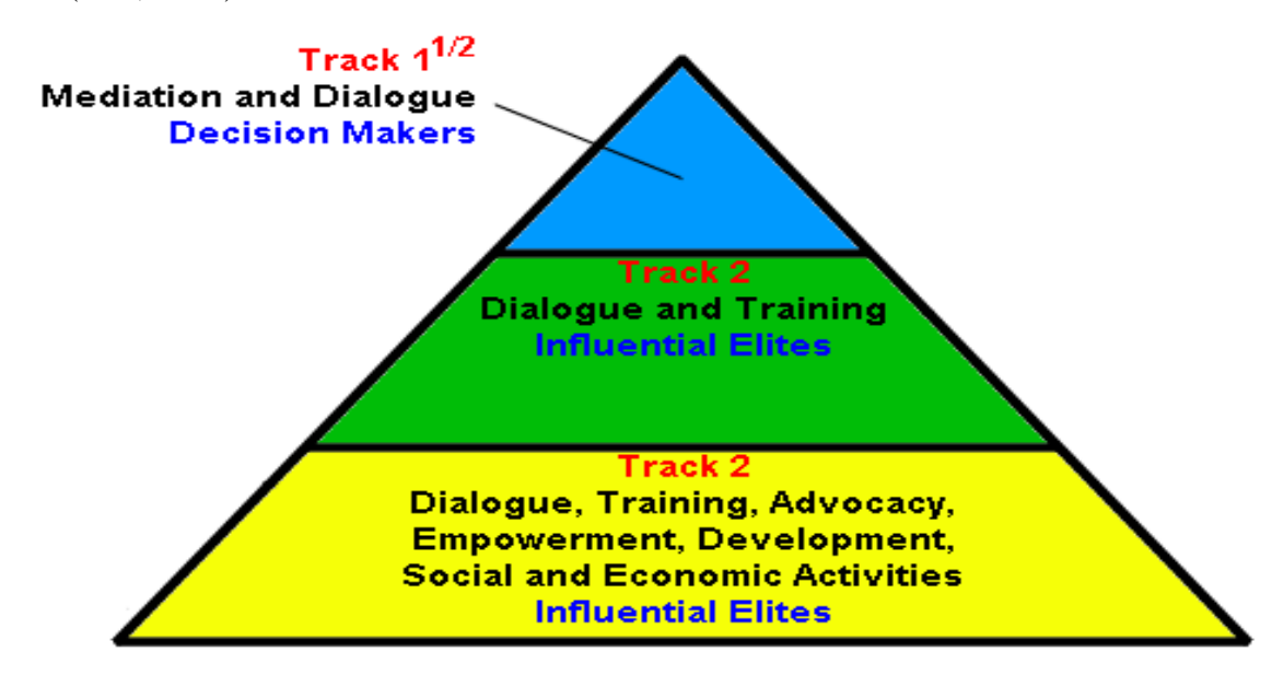
Figure 3 (Nan, 2003)

Track II diplomacy strengthens civil society actors' hand and brings non-official, influential and private people or actors who have the capacity to interact with society, into the process. These intermediaries facilitate dialogues and problem-solving meetings between parties as well as organize workshops.