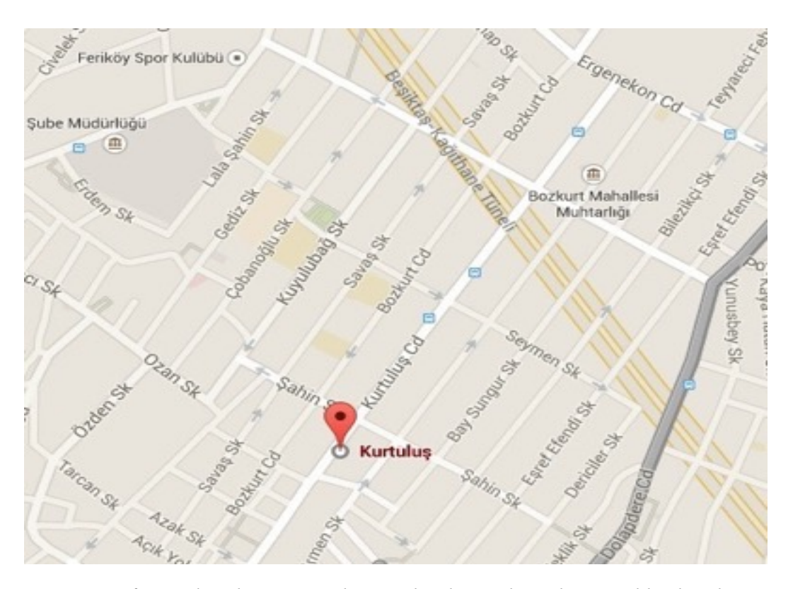
Map of Kurtuluş showing Bozkurt, Eskişehir and Feriköy neighborhoods

In this chapter, I trace the historical background of Kurtuluş as an old non-Muslim residential area; the recent mobilities of populations in the neighborhood; and the geographical distribution of the groups of residents, in light of the interactions of these groups with each other. Before, it would be illuminating for the readers if I map out the geographical borders and the demographic data of Kurtuluş which is a central district in the European side of İstanbul and its two neighborhoods, Bozkurt and Eskişehir. I specified two neighborhoods of the district because experiences and narratives of my informants were predominantly pointing out these territories<sup>12</sup>. Bozkurt neighborhood