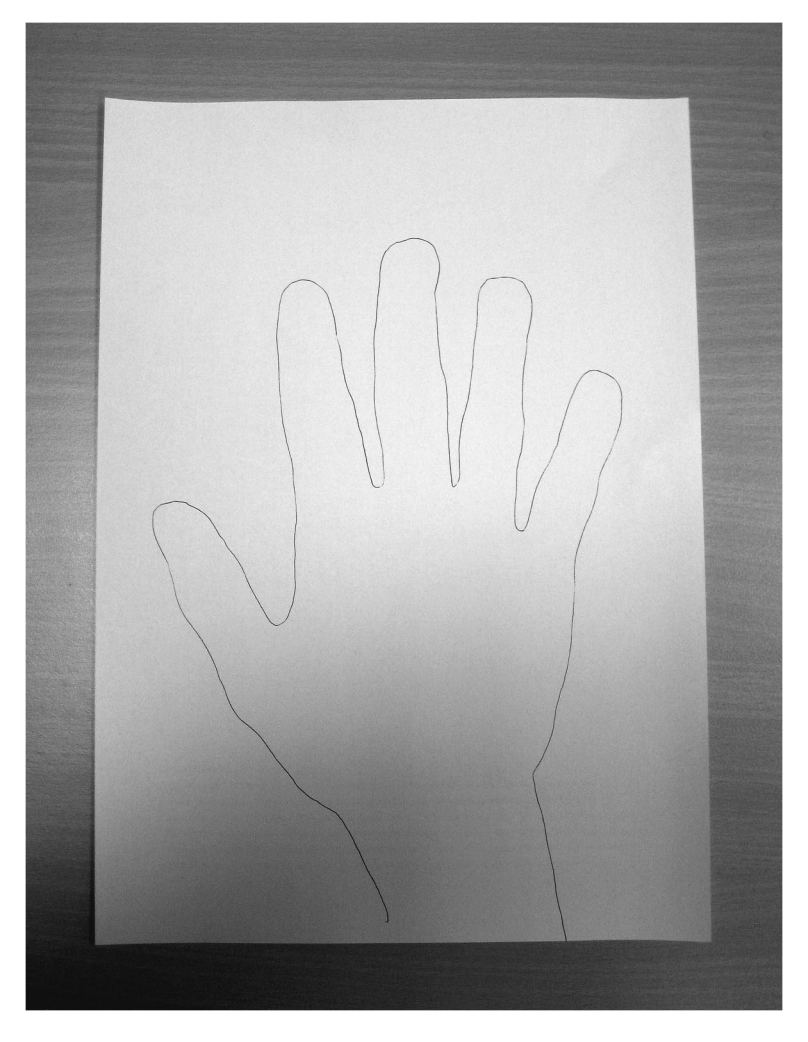
Figure 1. Example of a drawn hand used in the experiment.

indicated a drift towards the real hand. Participants pointed once before and once after each block (totally four times).