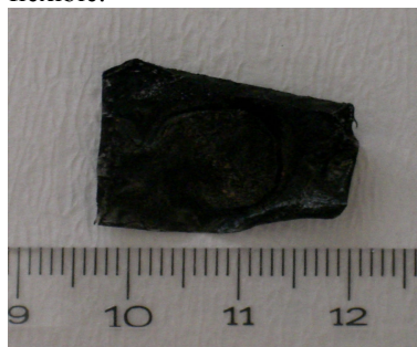
Figure 2: A photograph of GNS based electrode

Fuel cell electrodes made of GNS and their nanocomposites were fabricated by drop casting on commercial Nafion ® 212 membrane using %10 Nafion ® solution as a binder. Then, Pt catalysts were deposited on these electrodes by chemical reduction of a Pt salt under ultrasonic treatment about 2 hr. A photograph of GNS based electrode was presented in Figure 2. Electrode seemed to be flexible.