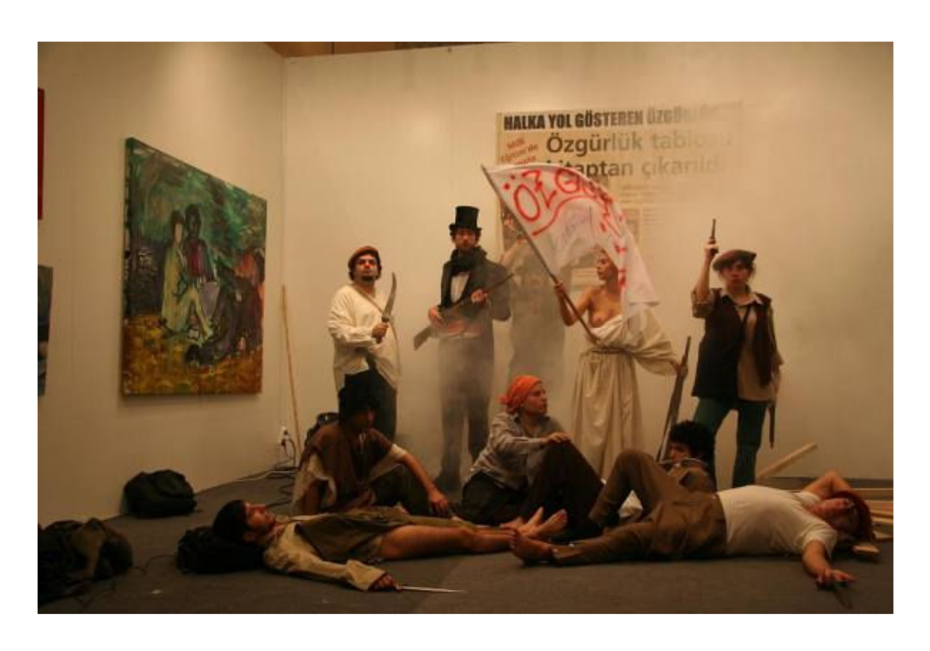
APPENDIX C Bedri Baykam, still from Hürriyet Halka Yol Gösteriyor