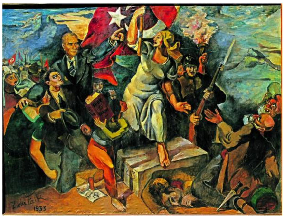
İnkılap Yolunda / Zeki Faik İzer