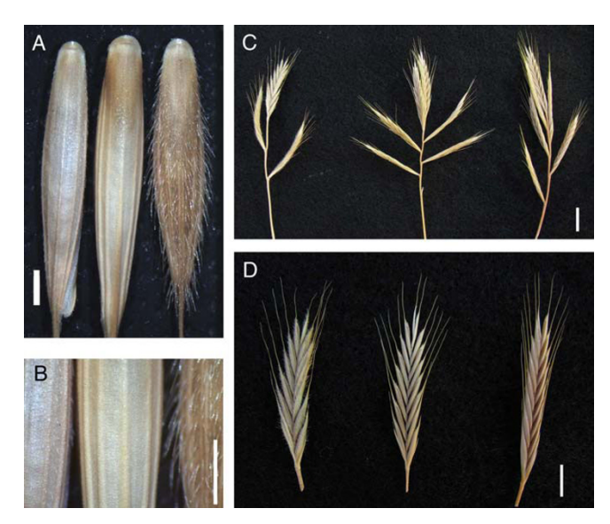
Figure 3 Phenotypic differences between diploid lines. (A and B) The presence of hairs on the lemmas differed dramatically. From left to right are lines Tek-I, Koz-3 and Koz-4. Note the presence of a few very short hairs on Tek-I and absence of hairs on Koz-3. Scale I mm. (C and D) Spikes from three lines grown under the same conditions. Note the variation in number of branches, angle of branches, number of seeds per spike and angle of the seeds. From left to right are lines Adi-I3, Tek-I and Tek-4. Scale I cm.

transgenic ovules, we scored the progeny of the wild-type plants for expression of the GUS reporter gene. Out of 2,233 progeny (1,494 from growth chamber grown plants and 739 from greenhouse grown plants) from 25 wild-type plants none expressed GUS. This indicates that the rate of outcrossing under 'worst case' laboratory conditions is exceedingly small.