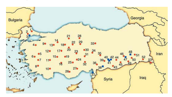
Figure 2 Location of collection sites in Turkey. Numbers correspond to the location numbers listed in additional file 3. Collections made by HB are designated by red dots and collections made by MT are designated by blue squares.

For the inbred lines developed from material collected by MT, we examined flowering time, vernalization requirements, seed size and presence of hairs on the lemma. This phenotypic analysis focused on easily scored phenotypes in order to determine if there was major phenotypic diversity in the collection. It is not intended to be an exhaustive examination of phenotype by environment interaction but rather to provide a resource to allow users to select lines with potentially useful variation in traits of interest. Flowering time was highly dependent upon the length of vernalization (additional file 4). All the lines required longer vernalization times to induce flowering than Bd21, Bd21-3, Bd2-3 or Bd3-1. Four or five weeks of vernalization was sufficient to induce rapid flowering in all lines except those from Tekirdag. The lines from Tekirdag required much longer vernalization times from 8-16 weeks. Growth under long day conditions (20 hr light: 4 hr dark) has previously been shown to promote the flow-